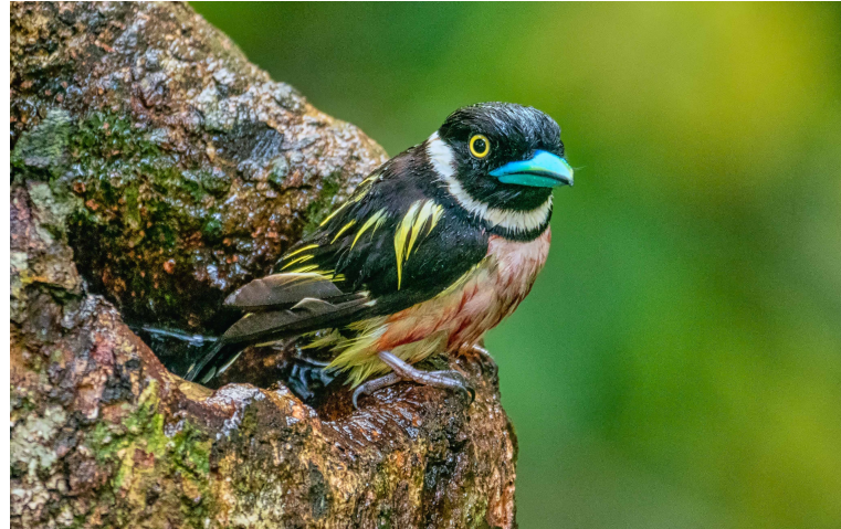
Black and Yellow Broadbill

Drive to one of the most biodiverse regions of Borneo, the Tabin Wildlife Reserve, which boasts an impressive 220 bird species as well as the wild banteng cattle and 10 primate species. Explore the reserve in 4x4 off-road vehicles hoping to find leopard cats, marbled cats, flying squirrels, and binturong bearcats in their natural habitats. Participate in a morning trek to the mud volcano, where salt-enriched mud bubbles up and attracts many different animals. Climb an observation tower and soak in the stunning views of the surrounding forest canopies. Meet the executive director of the Borneo Rhino Alliance who will teach you about current Sumatran rhino conservation efforts. Join nightly game drives to find nocturnal wildlife.