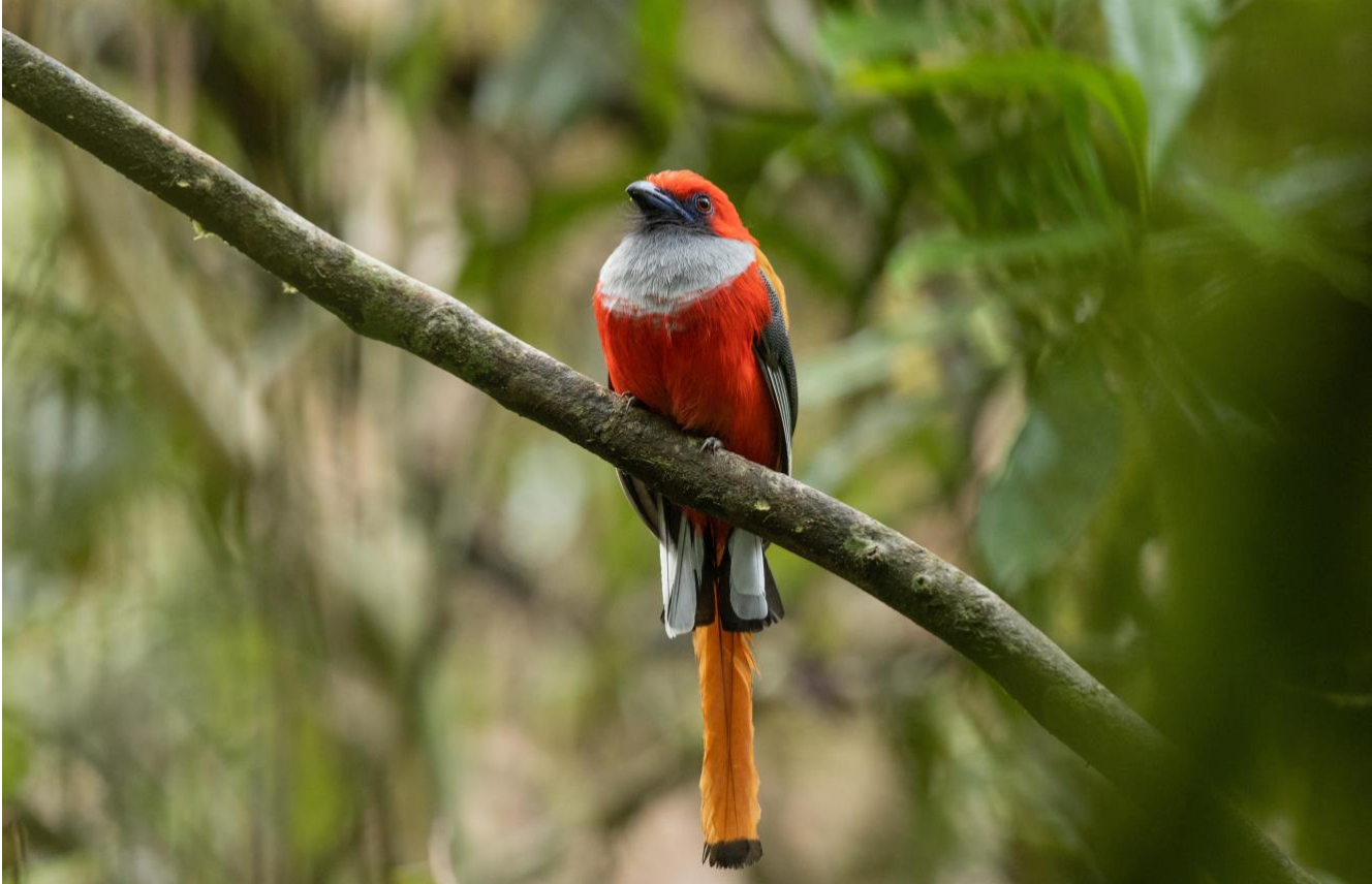
Whitehead's Trogon