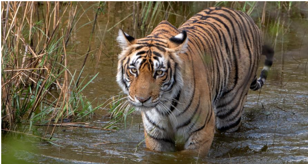
Bengal Tiger