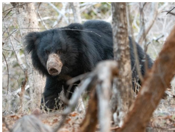
Sloth Bear © Ken and Mary Campbell

After lunch, drive (4.5 hours) to Ranthambhore National Park in Rajasthan where you will spend the next five days looking for tigers and other wildlife. Ranthambore National Park is famous for its tigers, as it's one of the best places in the country to see these majestic predators in the wild. The varied topography of the park is home to many mammals including predators like jackal, mongoose, sloth bear, and leopard, but the main attraction is tigers. Surrounded by the Vindhya and Aravali hill ranges and located near the outer fringes of the Thar Desert, Ranthambore offers the best of the desert lands.