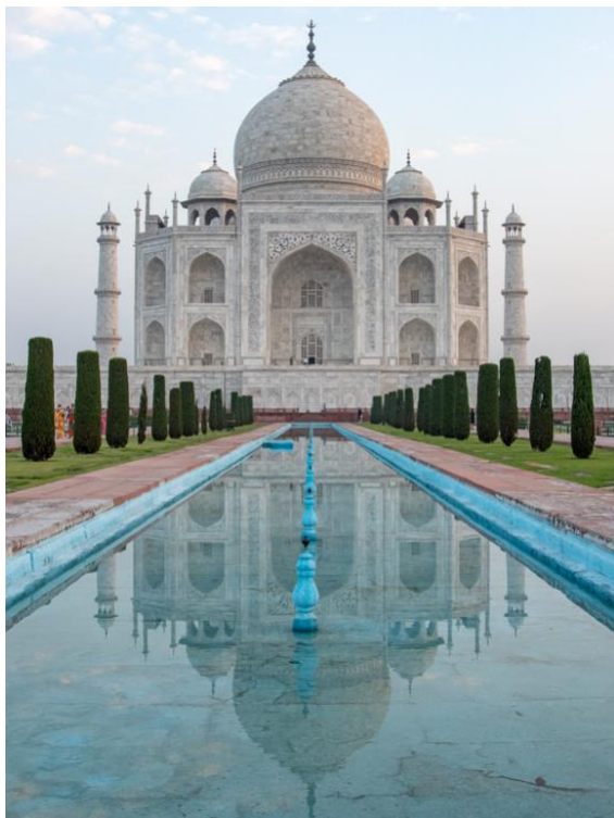
Taj Mahal

Get up early to arrive at the Taj Mahal for sunrise – the most magnificent, stunning time of day, with less people and fantastic photo opportunities. Built by Emperor Shah Jahan in memory of his beloved consort Mumtaz Mahal, this mausoleum is pure white marble. More than 20,000 people worked on the buildings and grounds combining Persian, Turkish, Indian, and Islamic architectural styles, taking 22 years to complete! It is truly one of the Seven Wonders of the World. The surrounding grounds are home to