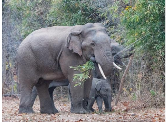
Asian Elephants

Eurasian hoopoe, purple sunbird, green bee-eater, several species of doves, and other birds. Return to the hotel for a late breakfast before driving (2 hours) to Bharatpur where your hotel is on 12 acres in a 200-year-old former maharajas' heritage garden with abundant bird life.