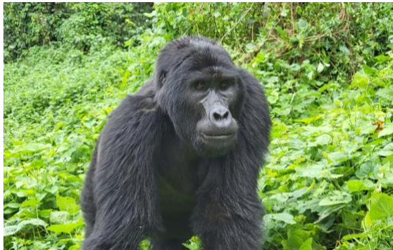
Mountain Gorilla

Wake up before dawn to hike into the forest arriving at your focal chimp group just in time to see them stir and wake from their nests. Observe their daily routines while they interact in their natural habitat, and watch them eat, groom, play, and care for their young. Your expert guide will describe their behaviors and help locate other animals that share the tropical forest.