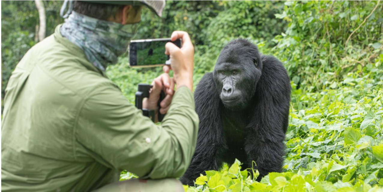
Mountain Gorilla