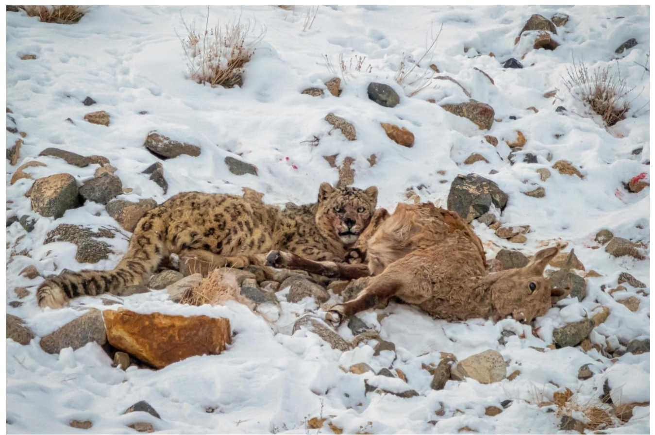
Snow Leopard