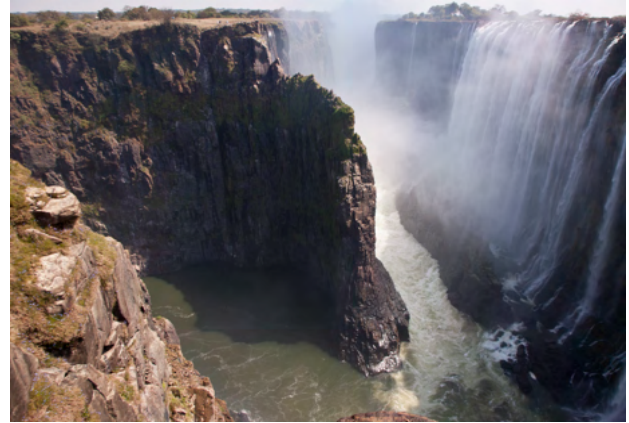
Victoria Falls

Experience the might and beauty of Victoria Falls, one of the Seven Natural Wonders of the World, located on the wide and powerful Zambezi River. The spectacular falls are the widest curtain of water in the world and plunges 330ft! Several species of birds, including trumpeter hornbills, do well in the moister forests bordering the falls. This morning, you'll travel along the Zambezi River, and take a guided tour of Victoria Falls. The Zimbabwean side of the falls is known for having the best views. Enjoy lunch at a café along the edge of the Zambezi River before enjoying another free afternoon.