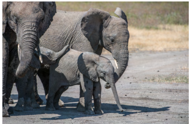
African Elephants

You'll have daily morning game drives to search for African wildlife. Moremi Game Reserve is among the best game reserves in Africa for viewing the endangered African wild dog, especially around Xakanaxa. With luck, you'll also see breeding herds of African elephant or even