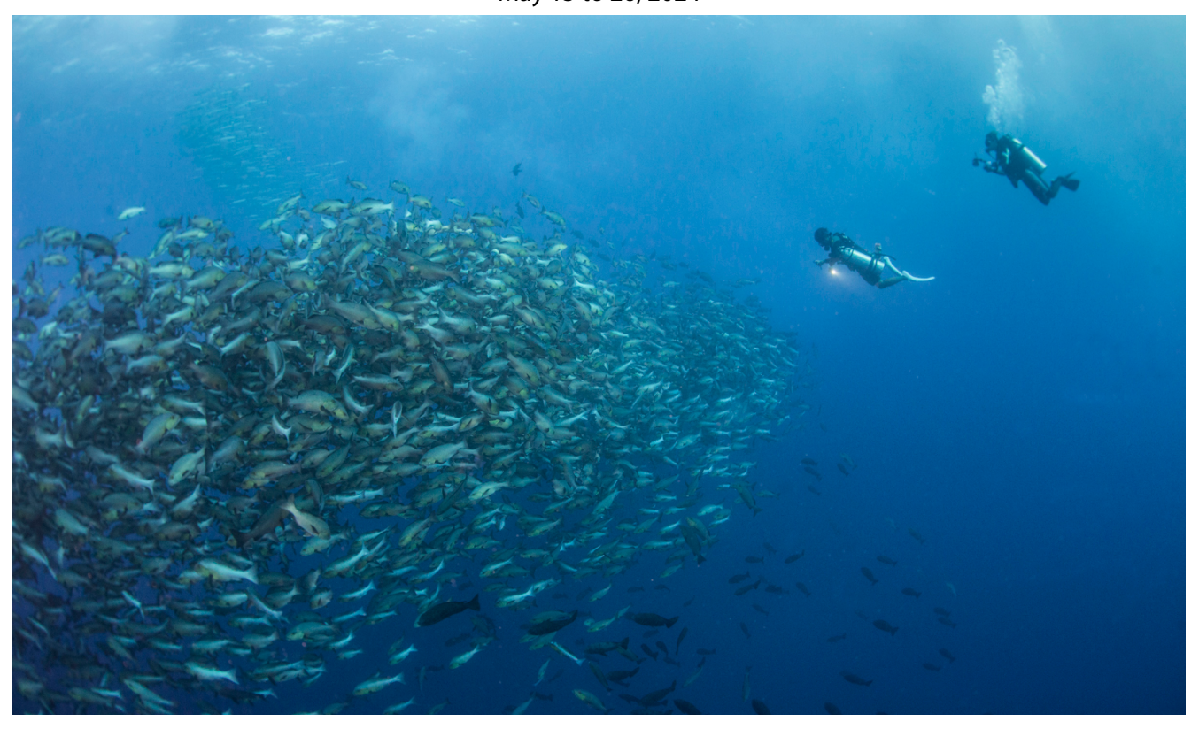
Red Snapper