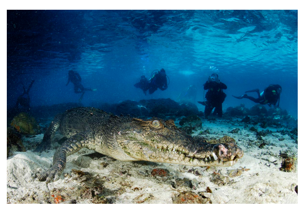
Saltwater Crocodile