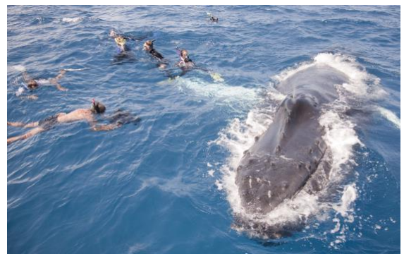
Humpback and Snorkelers

The numerous female humpback whales that choose the Silver Bank as their nursery for their newborn calves are usually nestled in the northeast corner of the Silver Bank, a relatively shallow area protected by coral heads. Although coral heads encompass the entire Silver Bank, the northeast corner has extensive coral that breaks the surface during low tides, giving protection to newborn calves (and you!).