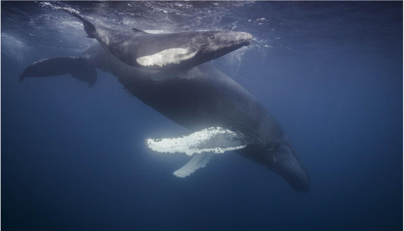
Humpbacks