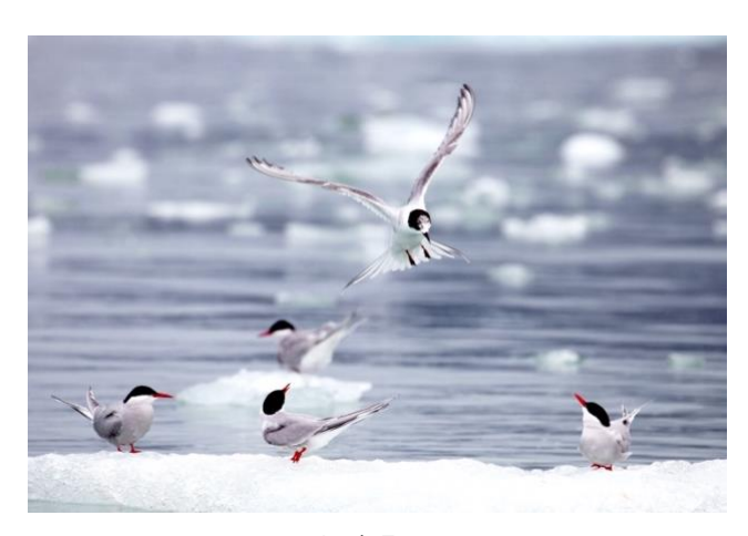
Arctic Terns

A note about Norwegian geography terms (as seen in many of the following place names): "bukta" means bay, "sund" means sound, "sundet" or "stretet" means channel or strait, "øy" or "øya" means island, "landet" means land or country, "breen" means glacier, and, of course, "fjord" or "fjorden" means fjord or inlet.