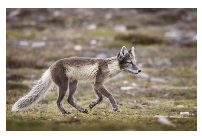
Arctic Fox

On the west side of Spitsbergen, Zodiac cruise along the famed Fourteenth of July Glacier (or Fjortende Julibreen, its Norwegian name) and other beautiful glacier fronts, such as Lilliehöökbreen, one of the largest, at 22km in length.