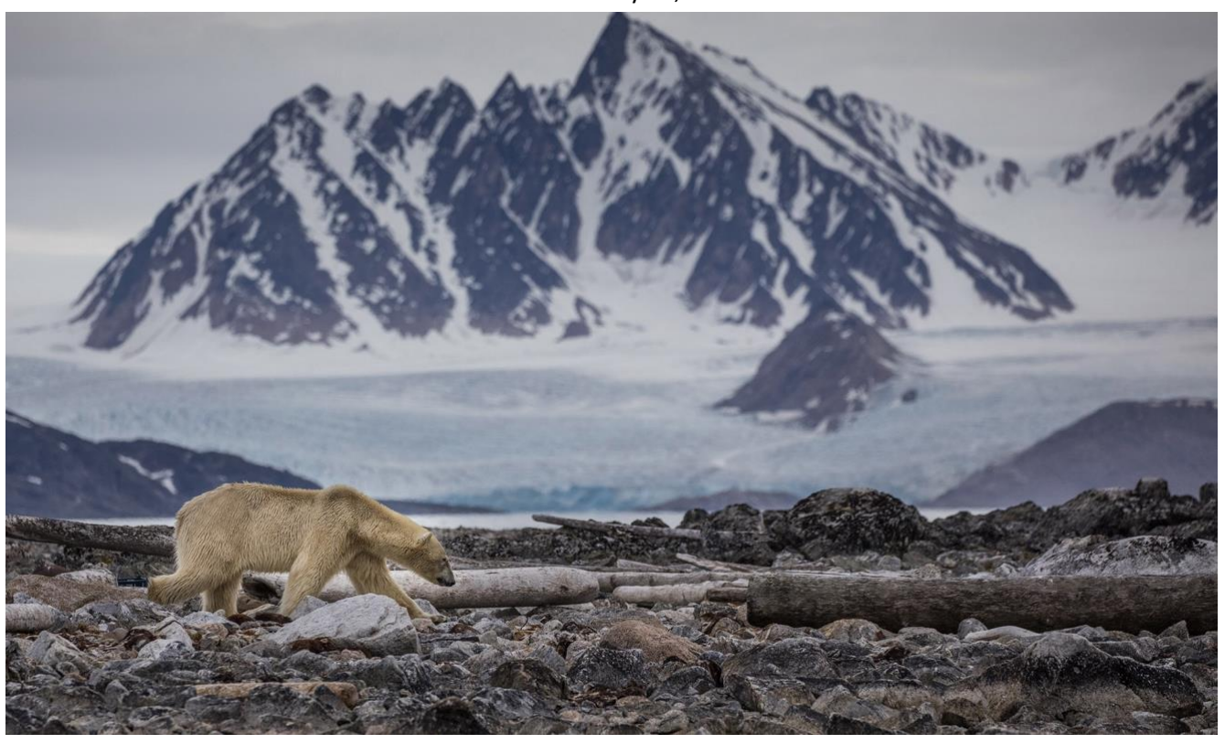
Polar Bear