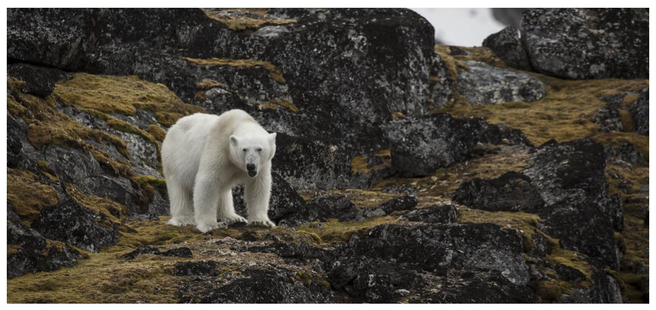
Polar Bear