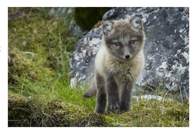
Artic Fox Pup

The entire group will disembark the ship in Longyearbyen around 9:00am and either transfer to the airport or, if you depart later in the day, into town.