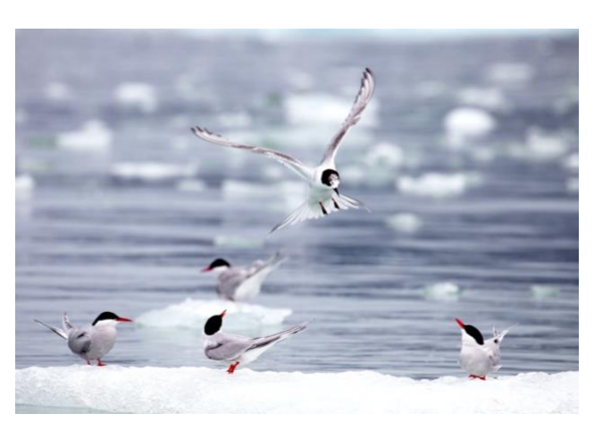
Arctic Terns

A note about Norwegian geography terms (as seen in many of the following place names): "bukta" means bay, "sund" means sound, "sundet" or "stretet" means channel or strait, "øy" or "øya" means island, "landet" means land or country, "breen" means glacier, and, of course, "fjord" or "fjorden" means fjord or inlet.