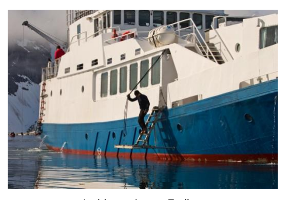
Ladder to Access Zodiacs

Don't let a fear of seasickness scare you away! For all but the most sensitive, seasickness is rarely a problem in this region. It's a good idea to bring medication if you get seasick or are unsure,