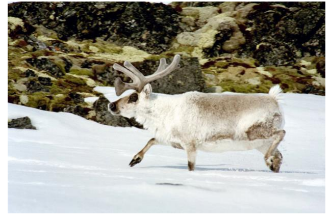
Svalbard Reindeer

Today you can choose to do some last-minute shopping, visit the excellent museum next to the Radisson Blu Hotel, explore the shore for birds, or take a side trip to other locales along the coast of Isfjorden. You'll board the ship in the late afternoon.