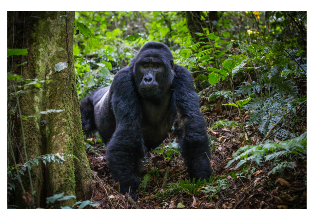
Silverback Mountain Gorilla

Begin the last morning at adjacent Bigodi Wetland Sanctuary, recognized for its extensive biodiversity and affectionately called "the paradise of birds," to view numerous bird species, primates, and other mammals including mongoose, warthogs, and otters. This wetland boasts a rich habitat and great conservation success story. The area, once known for poaching, is now managed by the locals who directly benefit from