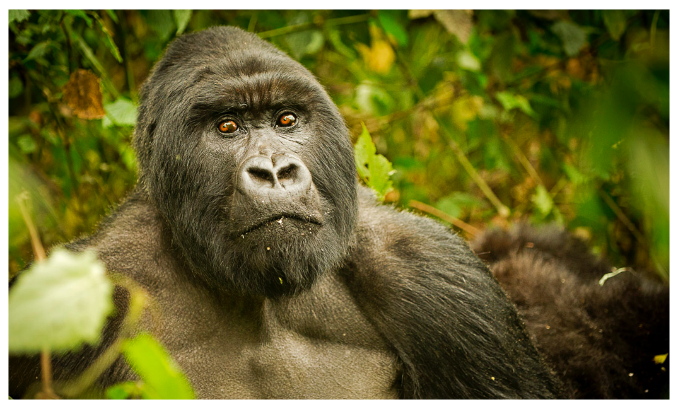
Mountain Gorilla