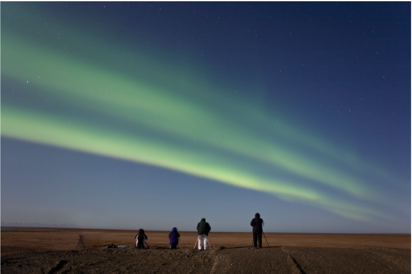
Aurora Borealis