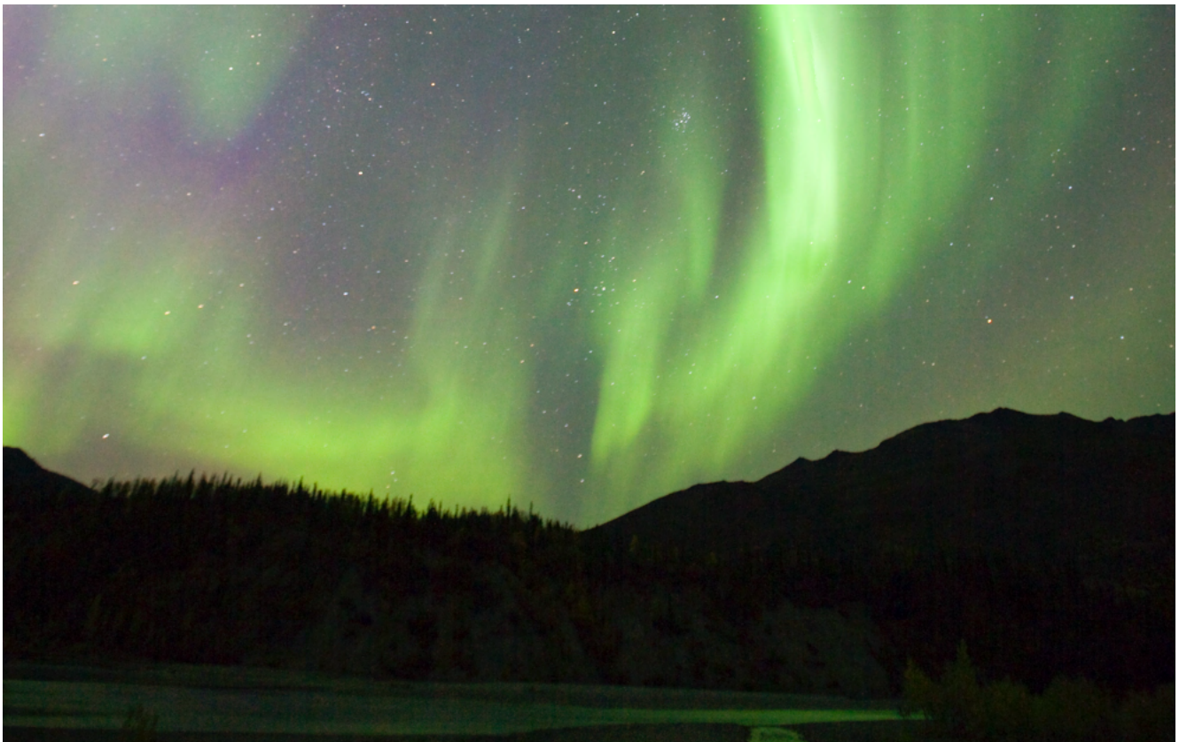
Aurora Borealis