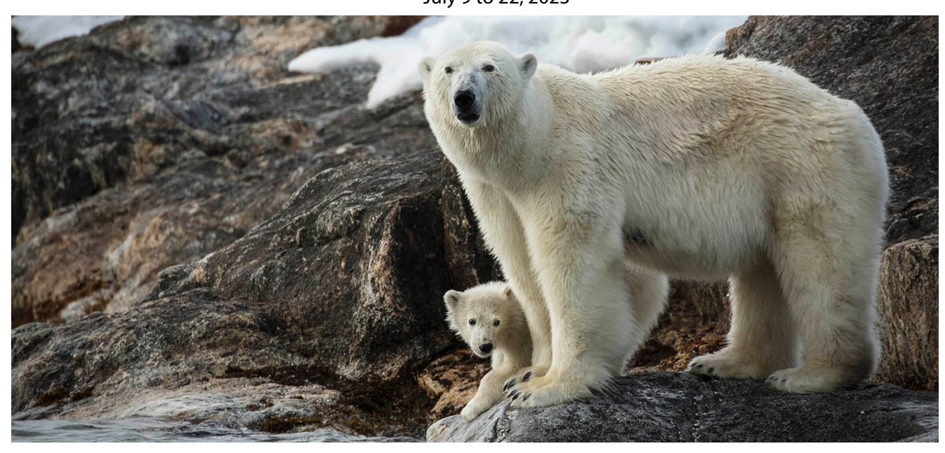
Polar Bears