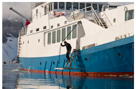
Ladder to Access Zodiacs

You must be able to get in and out of the Zodiacs, from the ship, via a six-foot ladder with staff assisting above and below you. Once ashore, you must be also able to get in and out of the Zodiacs onto the beach. You'll have opportunities for a range of activities from easy, short hikes to longer, more vigorous, snowshoeing hikes for those interested. Please contact us if you have any health concerns that may make this trip challenging.