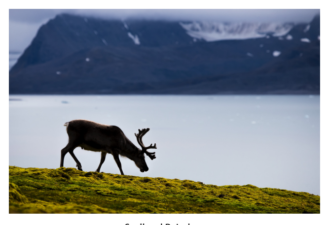
Svalbard Reindeer

Arrive in Longyearbyen, Svalbard, Norway, for an overnight stay before boarding the ship the next day.