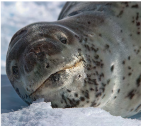
Leopard Seal

Enjoy the scenery from the ship as it navigates through stunning Neumeyer and Lemaire Channels or around the south end of Anvers Island into Biscoe Bay where you will be completely surrounded