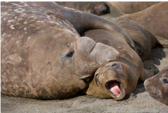
Southern Elephant Seals

Shackleton, Crean, and Worsley were very near the end of their dramatic and perilous self-rescue when they stumbled down into Fortuna Bay from the interior of the island. They had just one short hike remaining, a westward walk of about three miles to Stromness Harbour to reunite with civilization after over 17 months in the Antarctic. You'll retrace their trek over a 300-meter ridge with a stunning view across the König Glacier down to Stromness's rusting inactive whaling station to reunite with the ship.