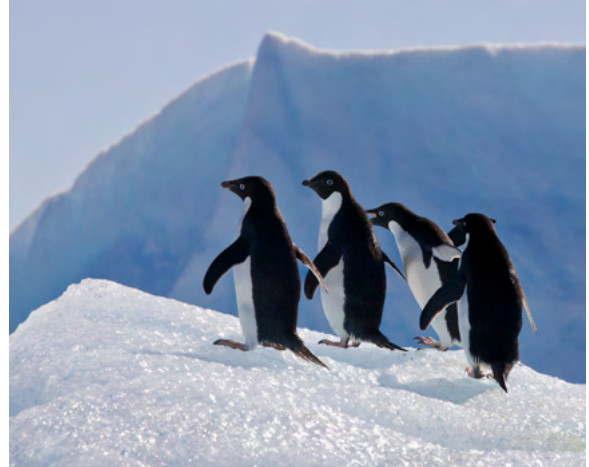
Adelie Penguins

These are a string of volcanic islands, some still active, that run parallel to the Antarctic Peninsula across the Bransfield Strait . Fondly known as the “Banana Belt of Antarctica,” these islands boast the richest concentrations of terrestrial wildlife in the Antarctic because of their proximity to the rich upwelling waters from the great Circumpolar Current. Even with our luxuriously in-depth itinerary, we will have to choose between many very compelling sites.