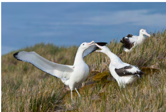
Wandering Albatross

60,000 pairs of king penguins call this glacial plain home, making it a beloved site for any who explore South Georgia. Salisbury is located in the Bay of Isles, looking out on the wandering albatross breeding islands of Prion and Albatross. If you sit down quietly, you may find yourself the subject of king penguin curiosity as one might try to see if your shoelaces will detach with a tug. King penguins have a staggered breeding season where each adult's activities are dependent upon what they did the season before. Those that had no chick or an early fledging chick the previous year will be courting and mating, whereas those that did have a chick in the previous year may delay breeding. These early breeders have the best chances of successfully fledging a chick this year. You will find molting penguins lining the freshwater streams that run from the glaciers to the sea. The charming South Georgia pipit, the world's southernmost passerine (perching bird), will look upon us curiously while singing. Hopefully snow will still be on the ground around the colony, a canvas of white upon which the penguins walk. The king penguins share the beach with fur seals and elephant seals, and