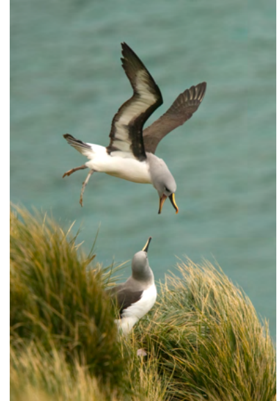
Gray-headed Albatross

This little sheltered cove sits on the northwestern extremity of South Georgia on the eastern side of the rugged Paryadin Peninsula, blocking Southern Ocean westerly winds with 400-meter walls built of ancient sedimentary rocks folded and stacked during the formation of the Andes. Later in season, the beaches of Elsehul will become prohibitively dense with fur seals, so this is a great time to visit to see the sublimely beautiful gray-headed albatross nesting on steep tussock grass slopes. Gray-headed albatross are the first to lay eggs here, so you are sure to find them sitting on nests looking over Elsehul's dramatic cove, a sight that few can hope for in a lifetime of travel! Black-browed albatross and macaroni, gentoo, and king penguins nest here, plus southern giant-petrels quietly incubating as long as you keep your distance.