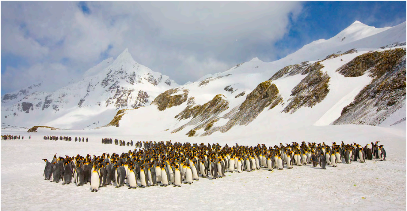
King Penguin Colony