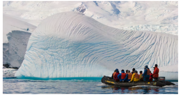
Zodiac Cruising among Icebergs

Over the last few decades, the Southern Ocean has experienced a significant warming trend, showing clear evidence of climate change. The Antarctic Peninsula has been feeling climate change the most with a massive 9°F (5°C) warming in average winter temperatures over the last 50 years. Although this has dramatically changed and reduced ice distributions, you will still be among a world of spectacular icebergs!