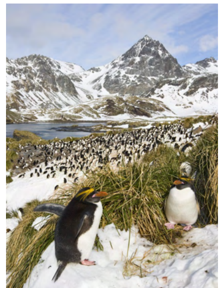
Macaroni Penguins

A colony of marvelous macaroni penguins and South Georgia's only colony of chinstrap penguins reside here. A hike up through tussock slopes will reward you with macaronis in a frenzy of early breeding season activity. You are sure to see chinstraps traveling through the surf and loafing on the