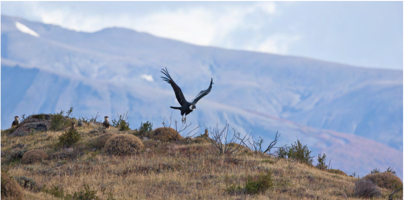
Andean Condor