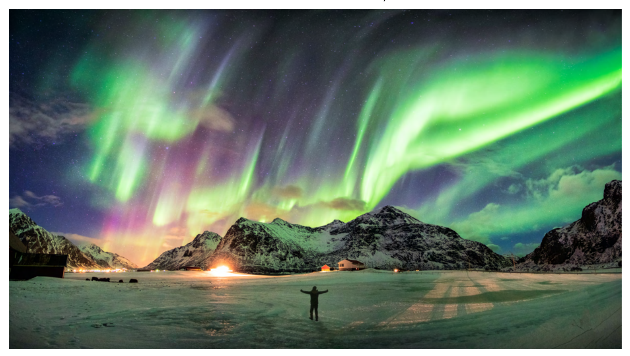
Aurora Borealis