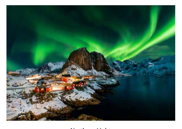
Northern Lights

Spend the day visiting Tromsø, where you can hike to the cable car to discover the panorama views from the mountain top, visit one of several interesting museums, or try your hand at dog sledding (costs extra). In the afternoon, hopefully if weather permits, observe the Northern Lights. In years past, folks have usually seen the Aurora during this time, and we'll also have reliable forecasts for solar activity, allowing us to know about possible intense auroras three days beforehand. However, a clear sky with no clouds, is needed and this does not always come at the same time, but in December 2020, we entered a new solar activity cycle and the Northern Lights will get stronger.