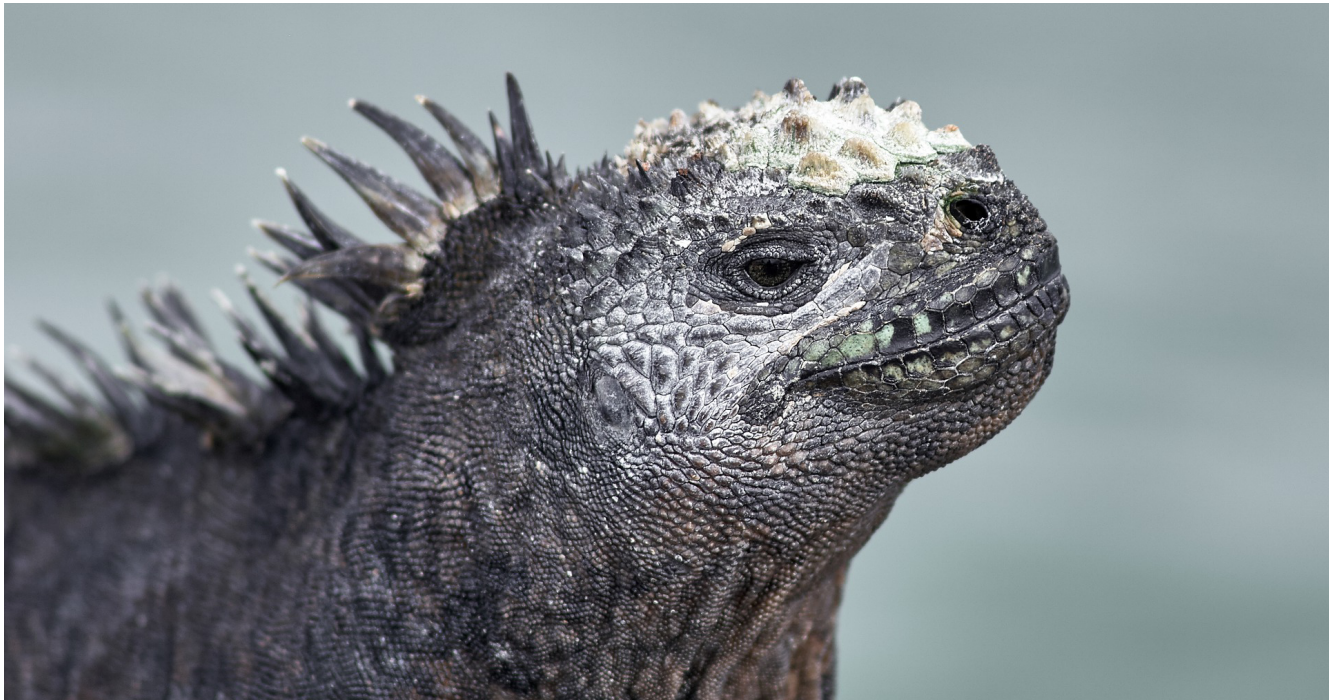
Marine Iguana