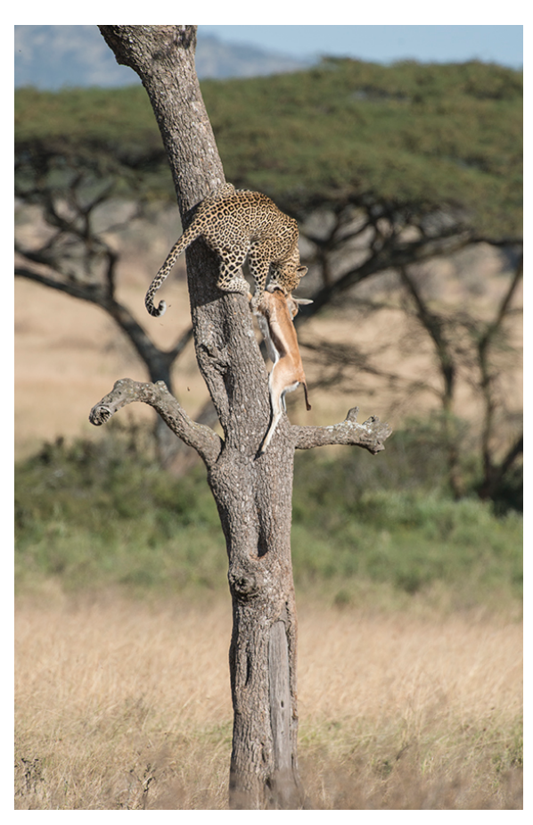
Leopard with Lunch

The Mababe Depression is a birder's paradise. The nutritious grasses that grow on the rich soils provide excellent seed for an impressive array of estrilids and viduids, such as the village indigobird and shaft-tailed whydah. These birds provide a good food source for small raptors such as the little sparrowhawk, shikra, gabar goshawk, and lanner falcon.