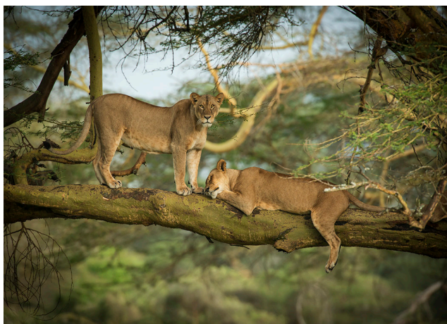
Tree-Climbing Lions

On the last morning, you will tour the Bigodi Wetland Sanctuary to see other primates and many birds. This wetland boasts a rich habitat and great conservation success story. The area, once known for poaching, is now managed by the locals who directly benefit from tourism. After touring Bigodi, you will follow your chimpanzee troop for the remainder of the day.