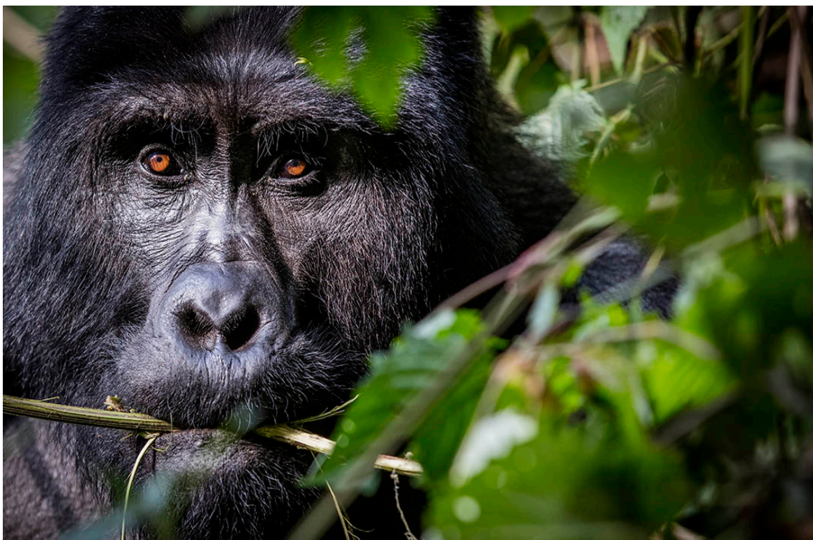
Mountain Gorilla