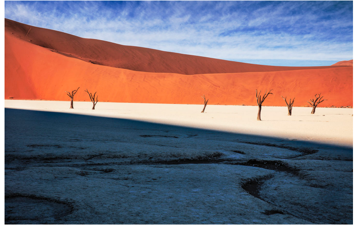
Salt Pans

After breakfast, enjoy your last day in Namibia with a scenic flight to Windhoek, and then fly to Johannesburg.