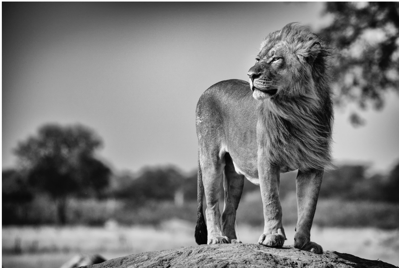
Lion