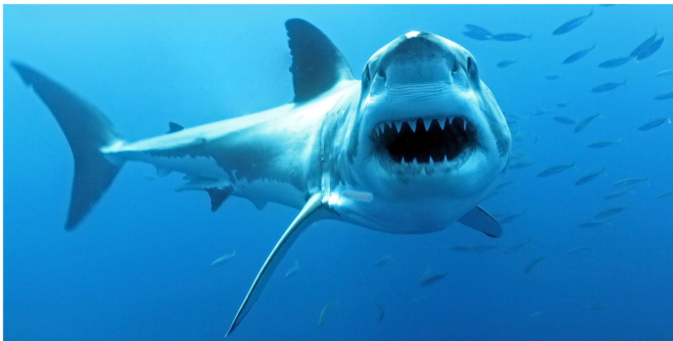
Great White Shark