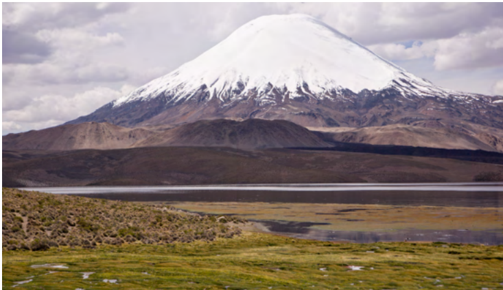
Lauca National Park

Immerse yourself in the breathtaking beauty of Chile's historic volcanic national park. Lauca National Park contains 140,000 hectares of Puna grasslands, situated on the Bolivian border at about 10,500 to 20,650ft. A World's Biosphere Reserve, this park was established to protect one of the highest lakes on the planet – the Chungará – and encompasses many habitat types, from salt pans and freshwater lagoons to Andean bogs and wind-swept Andean plains. Among this peaceful backdrop of snow-capped volcanos, you'll find birds adapted to the high Andes, including silvery grebe, crested and Andean ruddy ducks, Puna teal, ibis, and plover, plus three flamingo species.