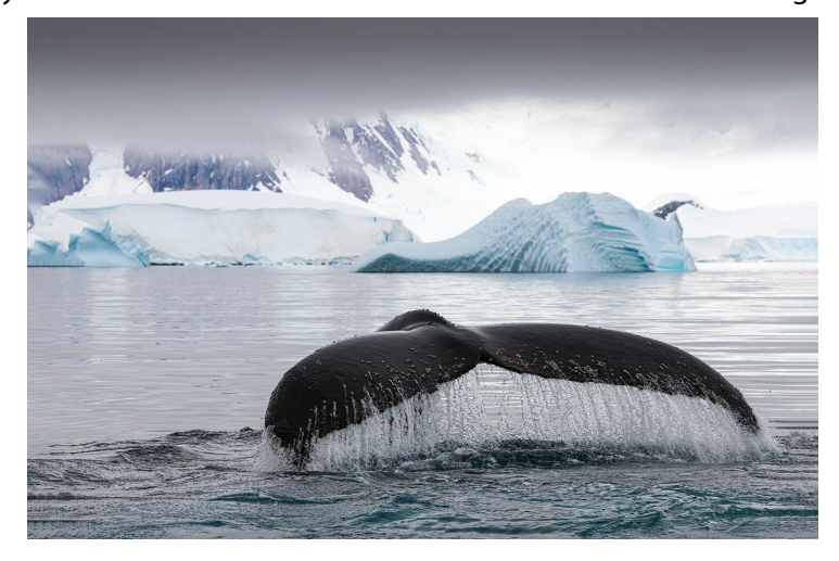
Humpback Whale Fluke

Due to the expeditionary nature of our voyage, specific stops cannot be guaranteed, and we will always seize the moment, adapting plans to experience wildlife and environmental conditions as opportunity comes our way. For great wildlife experience, luck favors the prepared! Flexibility is paramount in expedition travel; our itinerary depends on the conditions. We strive to land often and stay as long as