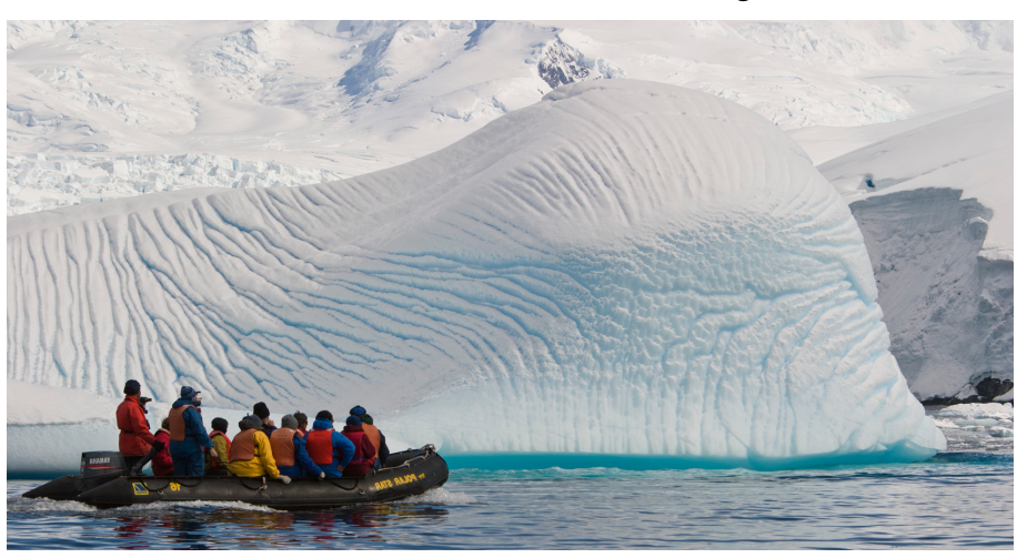
Zodiac Cruising Among Icebergs

Western Antarctic Peninsula ~ The Danco Coast, Neumeyer Channel, and Lemaire Channel Weather and ice distributions will determine whether we travel south down the west coast or sail east through the Antarctic Sound into the Weddell Sea; happily, you have ample time for a thorough exploration of the Antarctic Peninsula. When heading south, travel along the picturesque Danco Coast on the west coast of Graham Land. This area has awe-inspiring scenery with coastlines deeply indented with bays and scattered with islands. Impressive mountains rise sharply from the coast to the central Graham Land Plateau and glaciers descend to narrow piedmont ice shelves.