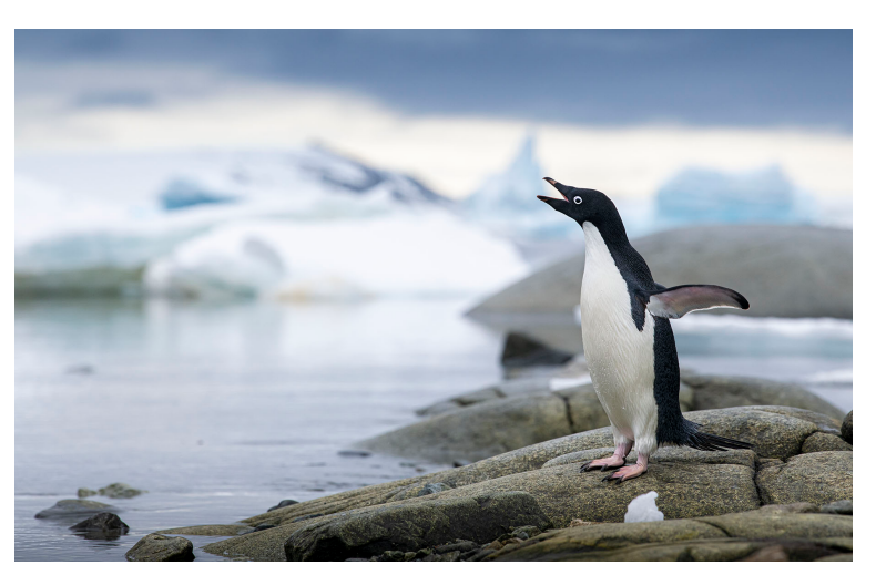
Adélie Penguin

Deception Island can be one of the most exciting islands on our voyage. This horseshoe-shaped, volcanic island is still active, as its hot thermal pools demonstrate. Deception Island also offers one the most unique experiences of the voyage soaking alongside the beach in the thermal pools surrounded by clouds of steam. Depending on the tide, the water temperature can be fairly comfortable, although it can get so hot that it's necessary to mix in colder water! Hopefully, you will experience the outer caldera, and then venture inside the caldera via a