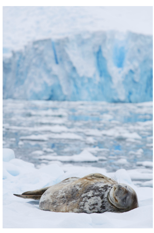
Weddell Seal

Every day will bring new opportunities, with time among whales, time ashore, or a combination of activities. The main whale species on the Peninsula are humpbacks and minkes, though chance may bring three ecotypes of killer whales, rare Arnoux's beaked whales, or an unexpected find of a great whale recolonizing habitat they formerly occupied before a