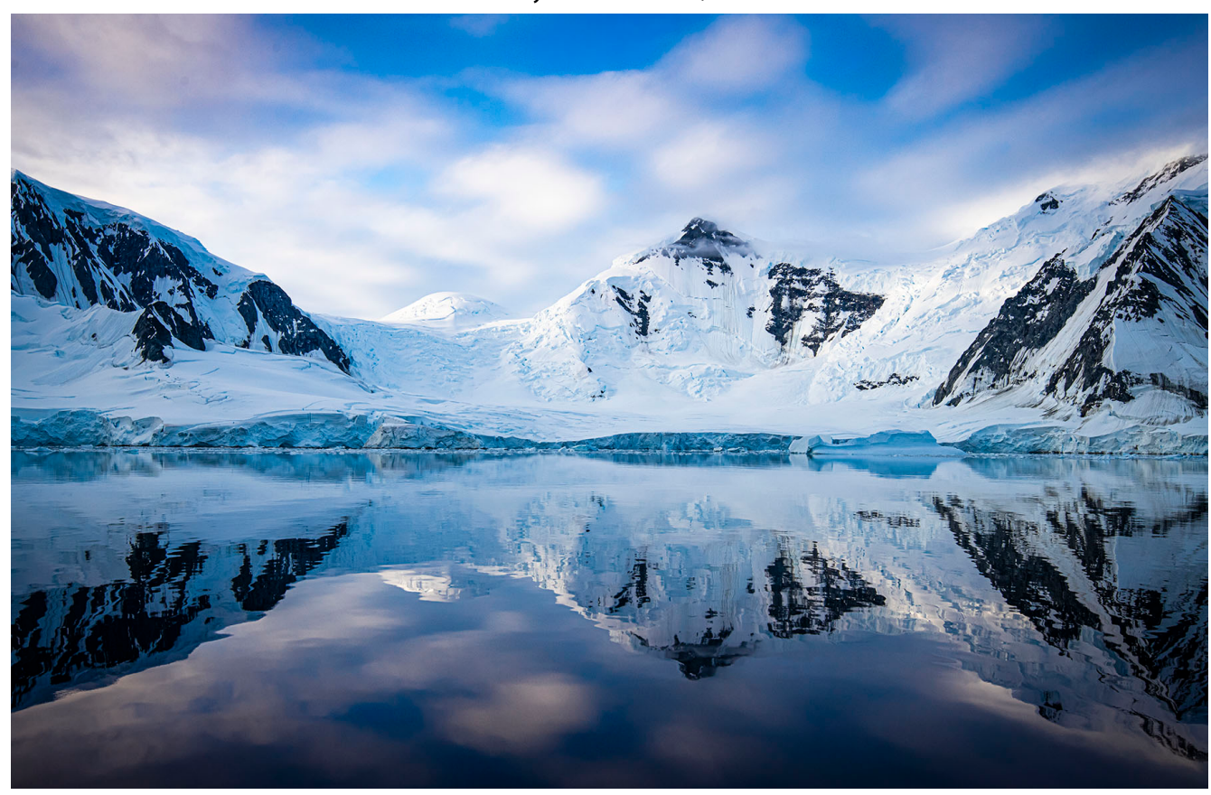
Quintessential Antarctic Landscape