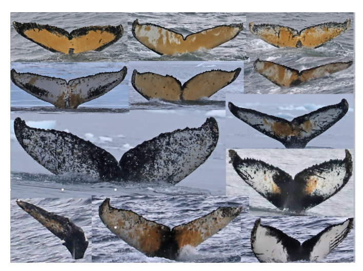
Compilation of Humpback Whale Flukes

beautiful Peltier Channel close to Neumeyer Channel, has a British Antarctica Survey maritime museum and a sprawling gentoo penguin colony. Tiny Cuverville Island is also a treat with gentoo penguins walking amid the snow and entering and exiting the beach.