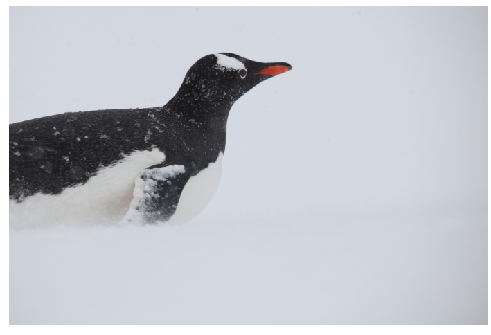
Gentoo Penguin

walk across the island past the southern elephant seal wallows, offering a terrific chance to see (and smell!) the world's largest species of seal, also perhaps hauled out Weddell seals and southern fur seals.