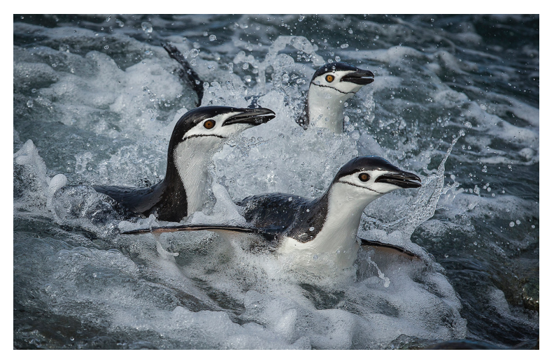
Chinstrap Penguins Swimming

(Tierra del Fuegans) once lived. Look for terns, kelp and dolphin gulls, and imperial cormorants, plus swimming Magellanic penguins. The shallow waters at the mouth of the Drake Passage are rich with sea life, and birds are usually present in huge numbers, especially sooty shearwaters and black-browed albatross. Schools of dolphins may also entertain you with bow riding and staff will always be on lookout from the bridge, in search of whales. After sunset, phytoplankton phosphorescing on the water and a brilliant, starry sky may be the rewards as you sail south into the open waters to Antarctica.