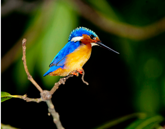
Malagasy Kingfisher