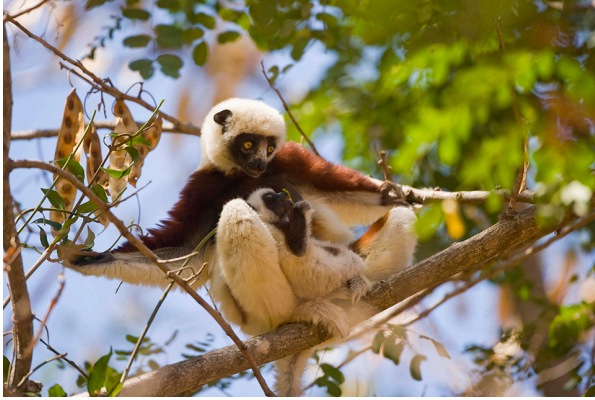
Coquerel's Sifaka with Young

While in Ampijoroa, enjoy early morning and nocturnal wildlife walks from your cabin and exploring the network of trails in Ankarafantsika National Park. The park comprises 135,000 hectares where the local Sakalava people still live. With luck, you may encounter the fossa, a very shy endemic mammalian predator that is closely related to mongoose. You can find eight species of lemurs near camp, and if you are lucky, you may find the golden-brown mouse lemur, one of the world's smallest primates. Coquerel's sifakas live in family groups that thrive and are extremely active throughout the forests. You will also encounter some of the region's endemic reptiles such as Cuvier's Madagascar swift, Oustalet's chameleon, and the rhinoceros chameleon.