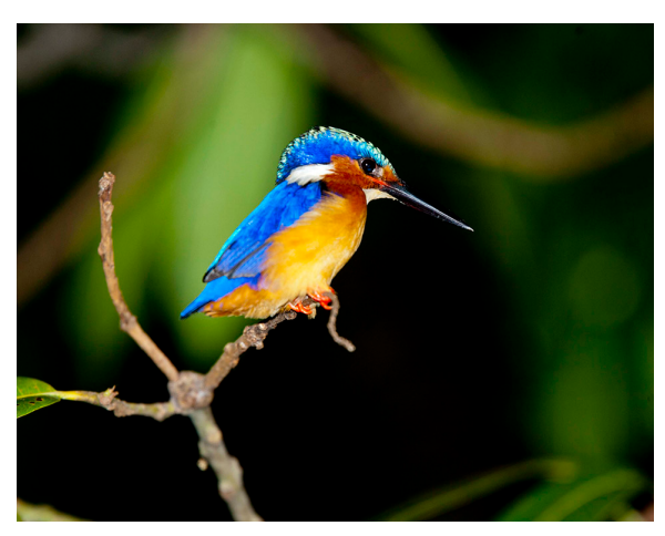
Malagasy Kingfisher