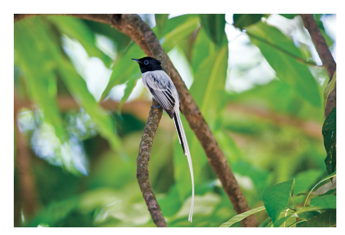
Malagasy Paradise Flycatcher

In the afternoon, navigate your way to Madagascar's highlands to reach Isalo National Park. In this highland region, you will witness many magnificent geological formations carved by small waterways, which attract diverse wildlife. Spend a full day and a half exploring this bizarre and picturesque landscape. Within this dry region, birds are diverse and omnipresent, so it's likely you will spot new species. Many reptile and amphibian species live here, including Dumeril's boa, white-lipped bright-eyed frog, and Malagasy rainbow frog. You will also take day and night walks in the hope of finding all six lemur species which reside in the region, half of them are nocturnal and the other half are diurnal.