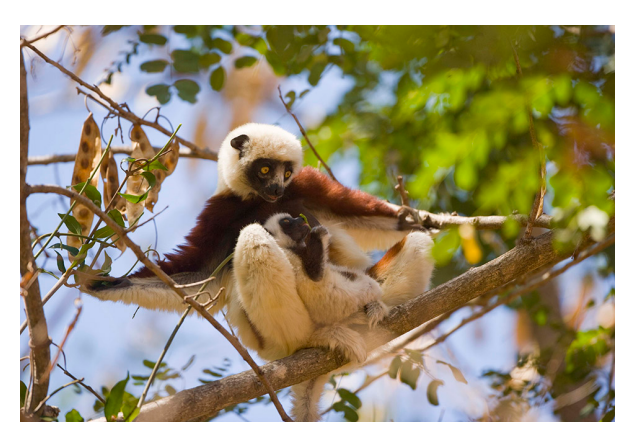
Coquerel's Sifaka with Young

While in Ampijoroa, enjoy early morning and nocturnal wildlife walks from your cabin and exploring the network of trails in Ankarafantsika National Park. The park comprises 135,000 hectares where the local Sakalava people still live. With luck, you may encounter the fossa, a very shy endemic mammalian predator that is closely related to mongoose. You can find eight species of lemurs near camp, and if you are lucky, you may find the golden-brown mouse lemur, one of the world's smallest primates. Coquerel's sifakas live in family groups that thrive and are extremely active throughout the forests. You will also encounter some of the region's endemic reptiles such as Cuvier's Madagascar swift, Oustalet's chameleon, and the rhinoceros chameleon.