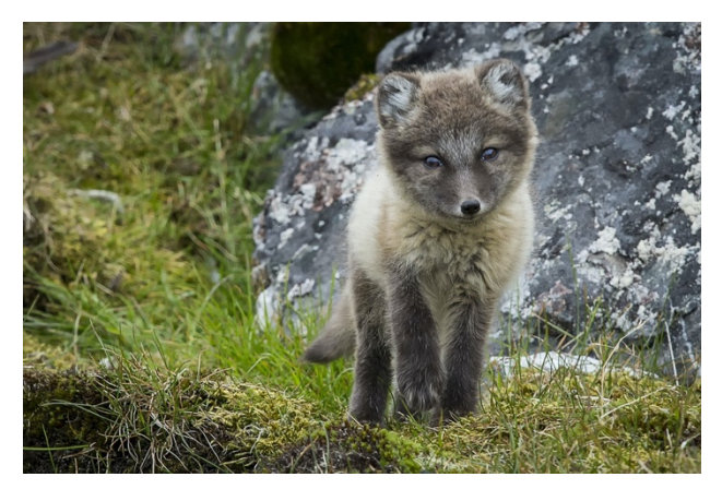
Artic Fox Pup

Your expedition will have an incredible amount of freedom to explore the Svalbard archipelago. With six more days than our typical expedition, you'll have more opportunities for polar bear sightings and for finding other Arctic wildlife of all shapes and sizes. The region hosts species that will present you with great opportunities to capture world-class images. Your small group expedition allows for flexibility and freedom to cruise around the shores. When on shore, you'll have the opportunity to hike, explore, and photograph wildlife and landscapes. You'll also find that Svalbard is a geologist's paradise with all the ancient colorful rock strata exposed and ready to explore.