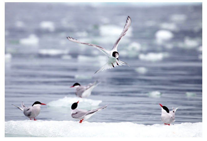
Arctic Terns

The waters around these islands are very calm compared to the Antarctic. Due to the shallow seas and the warming waters of the Gulf Stream, the climate is much milder than one would expect so far north. During this in-depth voyage, you will have ample opportunities to land ashore, Zodiac cruise, and view wildlife from the decks of our ship.