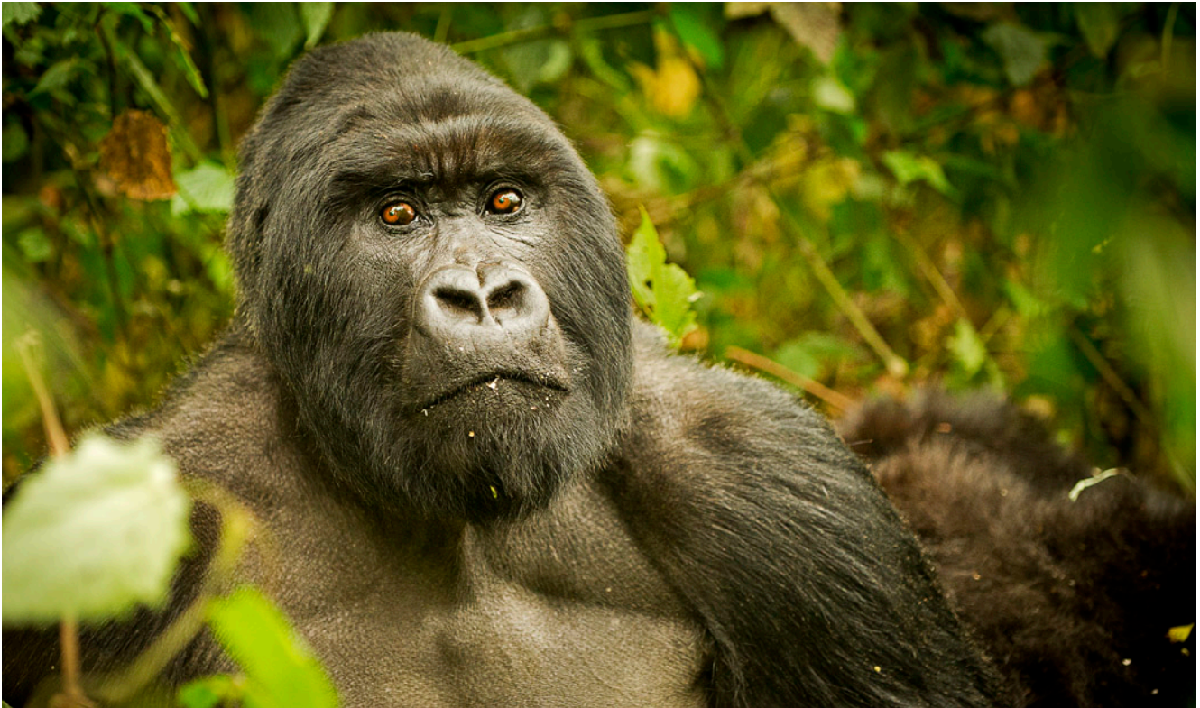
Mountain Gorilla