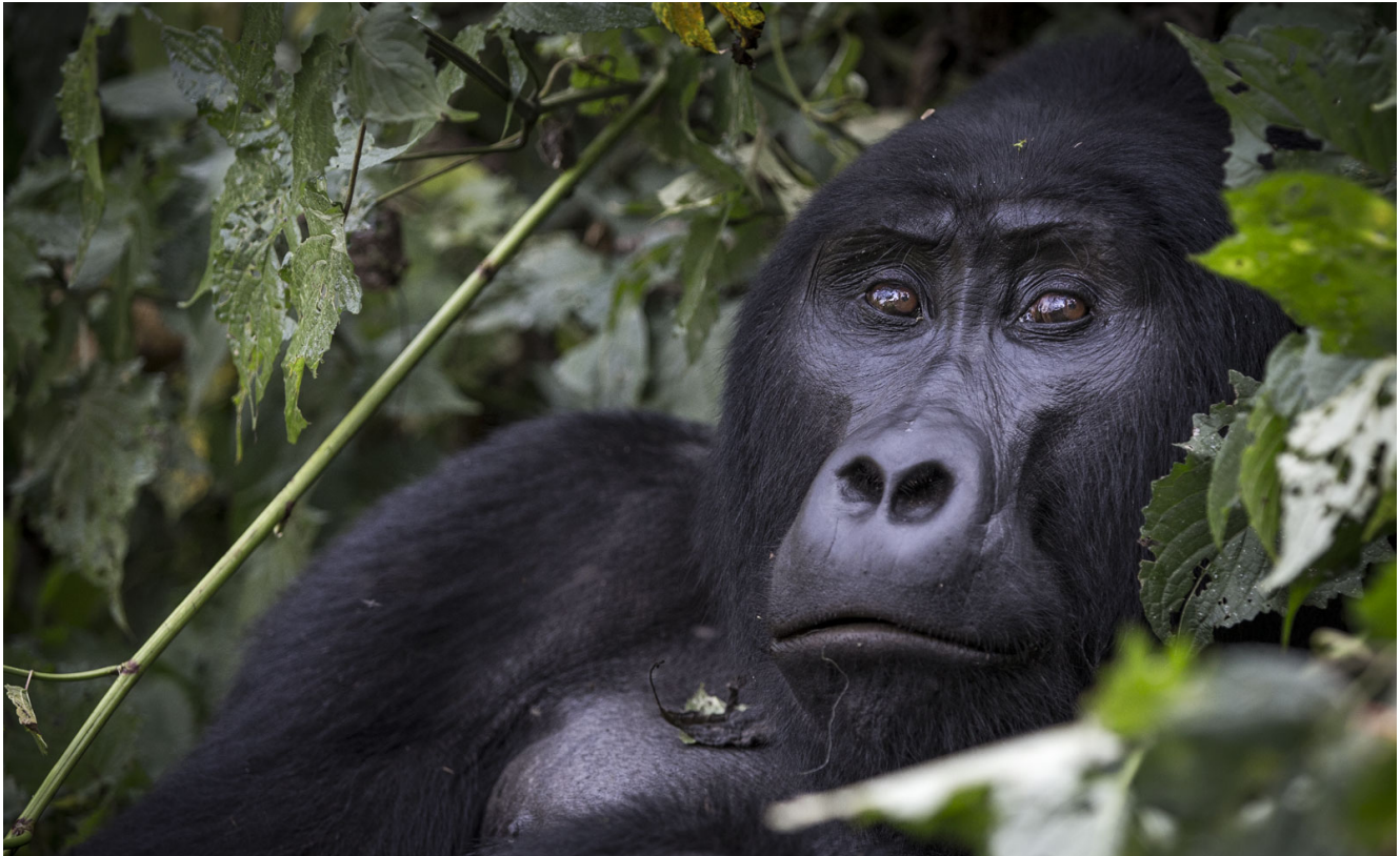
Mountain Gorilla