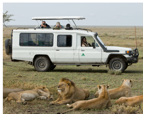
Land Cruiser

You travel in pop-top Land Cruisers with shaded roof covers that provide 360° viewing and excellent photography opportunities. With only four participants in each seven-passenger vehicle, you'll have more space for your gear and changing vantage points. Be prepared to experience bumpy, unpaved roads, and although our vehicles are comfortable, you will be jostled around.