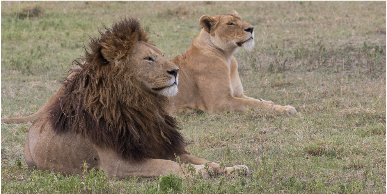
Lions