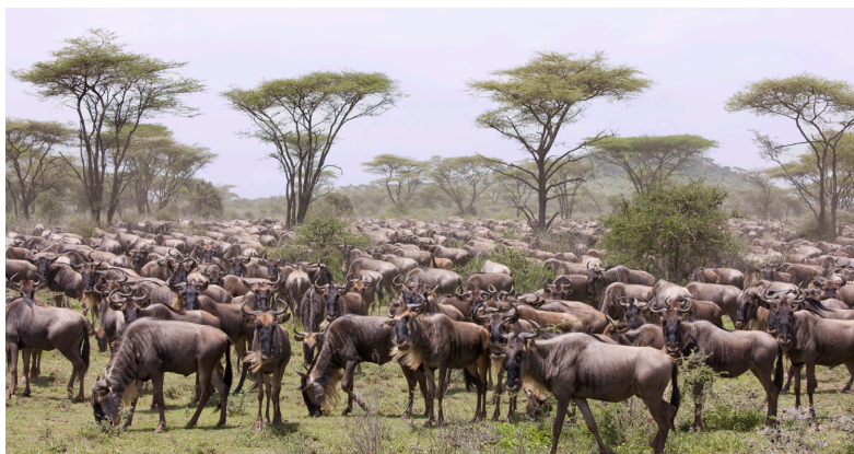
Wildebeest