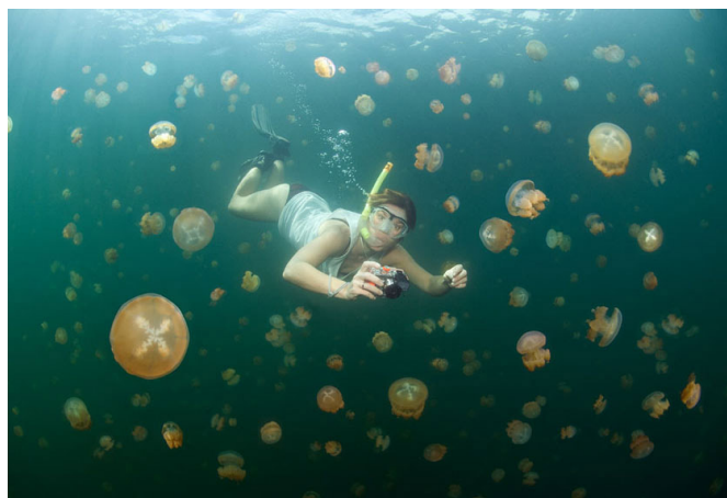
Snorkeling in a Jellyfish Lake

Explore a rainbow of diversity as you snorkel or dive among dazzling schools of mandarin fish. The complex reef system within this collection of uninhabited limestone islands supports more than 385 types of coral, sustaining a large variety of plant, bird, and marine life. You will discover endemic populations of ocean species in the unusual collection of marine lakes located here (isolated bodies of seawater separated from the ocean by land barriers). Some lakes are home to millions of non-stinging jellyfish that you can swim amongst! The ship will anchor in the heart of this distinct landscape, allowing for beach BBQ dinners and