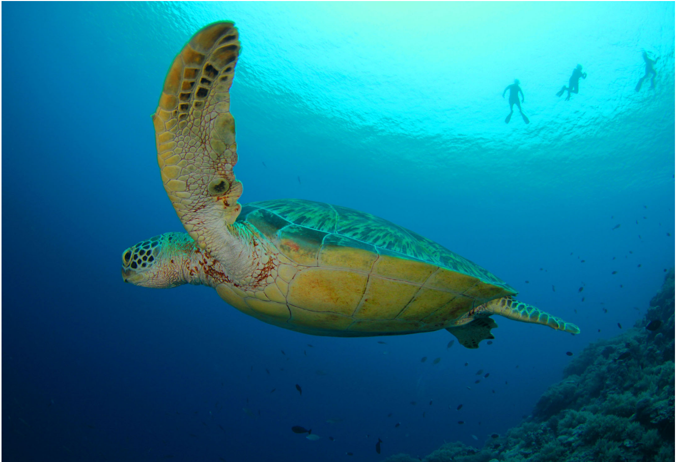
Green Sea Turtle