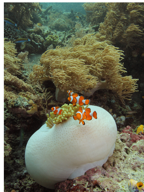
Family of Clown Fish

Arrive at Tobi Island by early morning. Explore this small limestone island, learning about the culture and lifestyle of the 16 people that live here and that of their ancestors, a culture with a separate dialect endemic to Tobi. Tour the culturally-modified island to see taro patches that have sustained the inhabitants for more than 150 years and visit other significant cultural sites. You will also SCUBA dive or snorkel in the reefs around this unique island.