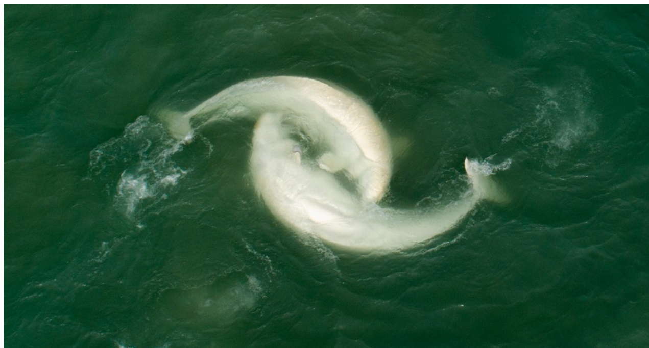
Beluga Whales