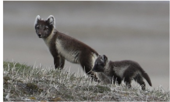
Arctic Fox with Pup

Travel to Flatrock Falls and either hike or truck to the mesmerizing unnamed canyons of Somerset Island. As you wander along these canyons that span up thousands of feet, look down in search of fossils that offer a glimpse into this unique region's past. You will also have many opportunities to observe the nesting sites of terns, plovers, and snow geese. After lunch, travel to Gull Canyon to witness the contrast between the desolate landscape that surrounds you and hidden corners rich with wildlife gems.