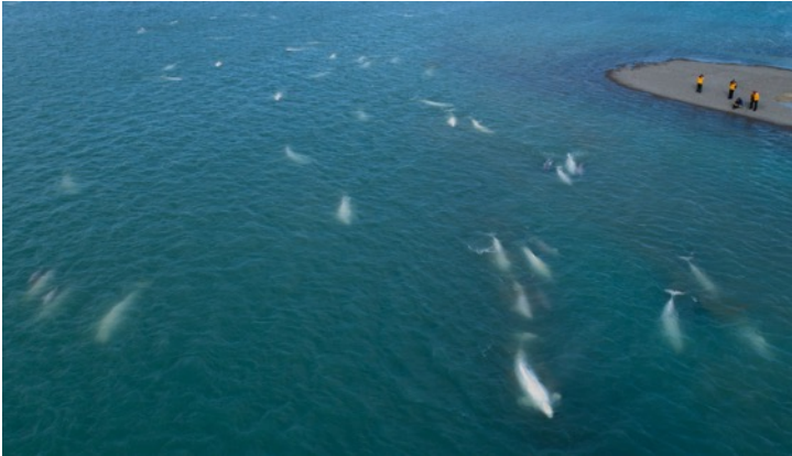
Beluga Whale Congregation

In the morning, get a quick introduction to the lodge's ATV's, and then go on a short walk to the Cunningham River estuary. Marvel as hundreds of beluga whales take shelter in the river mouth, only a few yards from shore. Observe these unique mammals socializing and hear their unique sounds they use to communicate. After lunch, you may hike to the five-story Triple Waterfall with opportunities to see nesting peregrine falcons, loons, snow buntings, sandpipers, and rough-legged hawks. On your way back to the lodge, you'll cross a picturesque canyon with opportunities to see musk oxen wandering amongst beautiful Arctic flowers.