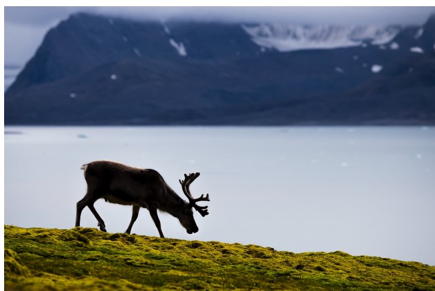
Svalbard Reindeer

Arrive in Longyearbyen, Svalbard, Norway, for an overnight stay before boarding the ship the next day.