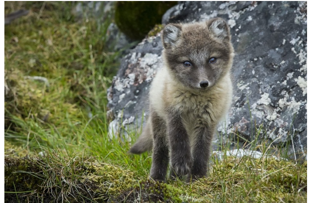
Arctic Fox Pup

Hike along the colorful lichen-covered cliffs on this small island on the northwest coast of Spitsbergen. There is an accessible breeding ground of seabirds here.