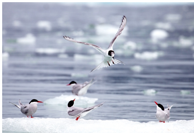
Arctic Terns

Your expedition will have an incredible amount of freedom to explore the Svalbard archipelago. In the land of 24-hr daylight, you'll search for Arctic wildlife of all shapes and sizes. The region hosts species that will present you with great opportunities to capture world-class images. Your small group expedition allows for flexibility and freedom to cruise around the shores. When on shore, you'll have the opportunity to hike, explore, and photograph wildlife and landscapes. You'll also find that Svalbard is a geologist's paradise with all the ancient colorful rock strata exposed and ready to explore.