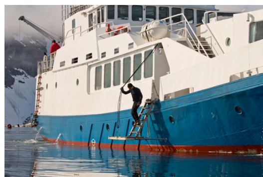
Ladder to Access Zodiacs

Don't let a fear of seasickness scare you away! For all but the most sensitive, seasickness is rarely a problem in this region. It's a good idea to bring medication if you get seasick or are unsure, but you may find that you do not need it after a couple days once you have your "sea legs." Even those who have experienced seasickness reported that the incredible wildlife and overall experience were well worth the temporary discomfort. Read our suggestions for coping with seasickness at www.cheesemans.com/seasickness and contact us if you have any concerns.