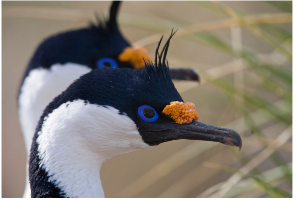
Imperial Cormorants

than anywhere else on Earth, at least a quarter million birds! From a distance, the immense colony on the lower shores looks like freshly fallen snow. As you approach, you'll see thousands of birds circling in the air and rafting on the water like tiny icebergs, and once ashore, maneuver through the tall, wispy tussock grass to arrive at the colony and experience albatross flying very close overhead.