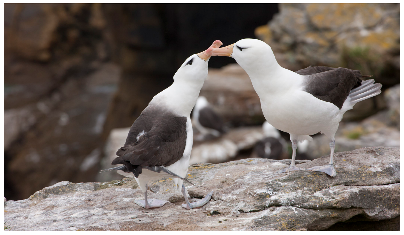
Black-browed Albatross