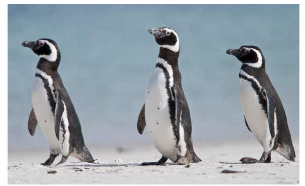
Magellanic Penguins

The following morning depart Stanley for a full day excursion. After a roughly 2.5-hr drive by Landrover, you'll arrive at the white sandy beach and turquoise waters of Volunteer Point, a destination with almost a Caribbeanesque feel to it, but the king, gentoo, and Magellanic penguins will bring you back to the Falklands. Discover the largest accessible king penguin colony in the Islands, outside of South Georgia, containing approximately 1,000 adults. You may also find other wildlife such as long-tailed meadowlarks, austral thrush, South American snipe, South American tern, blackish and Magellanic oystercatchers, and upland, kelp, and ruddy-