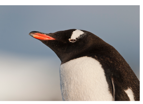
Gentoo Penguin

Weather permitting, sail to Steeple Jason Island. We will do everything in our power to get the group there, but rough seas can delay or cancel this departure. Steeple Jason is the outermost northwest island, now a reserve owned by Wildlife Conservation Society. Albatross are the main attraction, their nests thickly wrapping around the base of the striking island. More black-browed albatross nest here