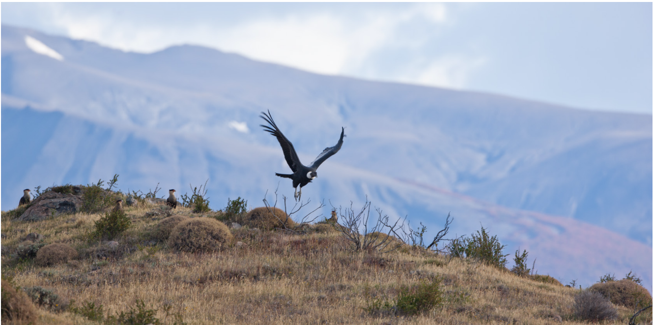
Andean Condor