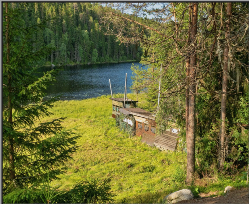
My Photography and Observation Blind