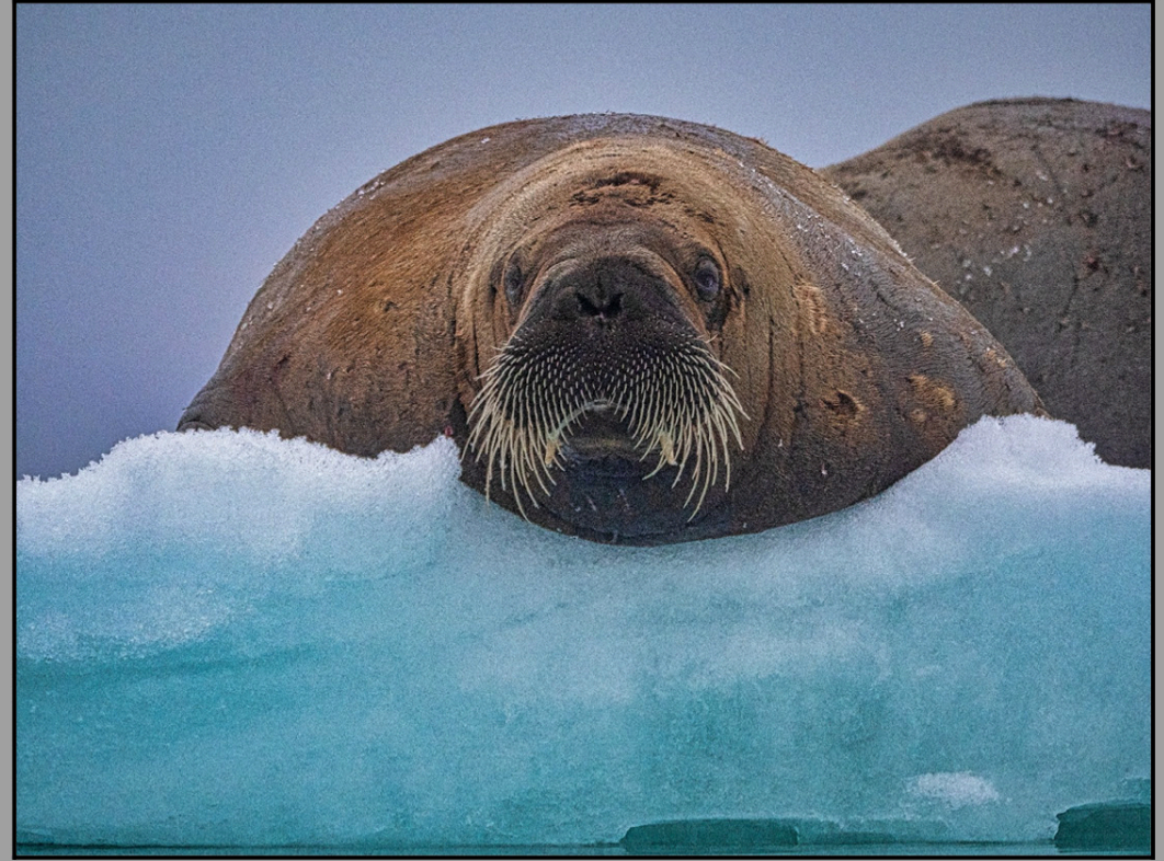
I'm Bored, Aren't You?