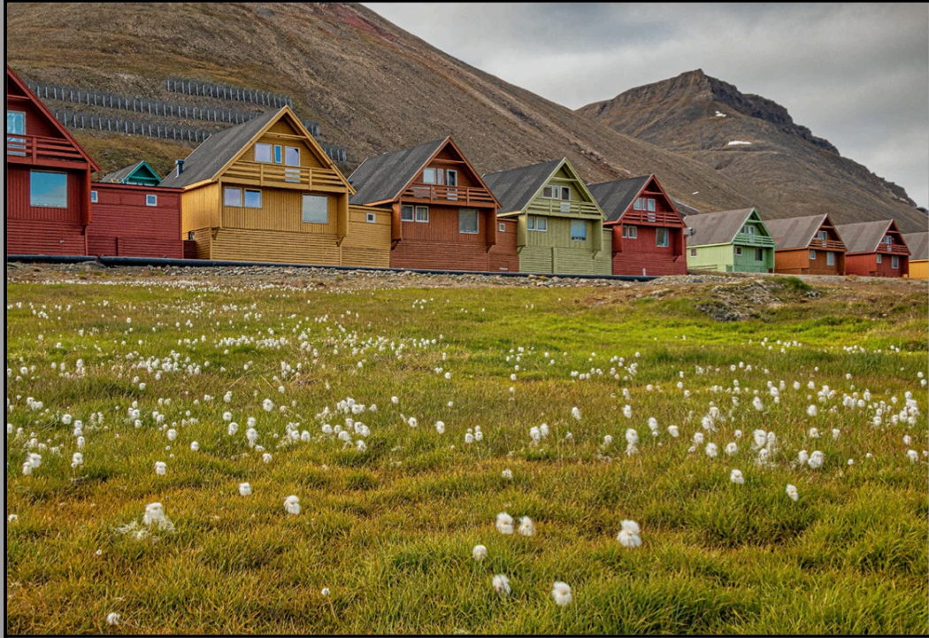
Eriophorum (Cottongrass) Accentuate Colorful Houses