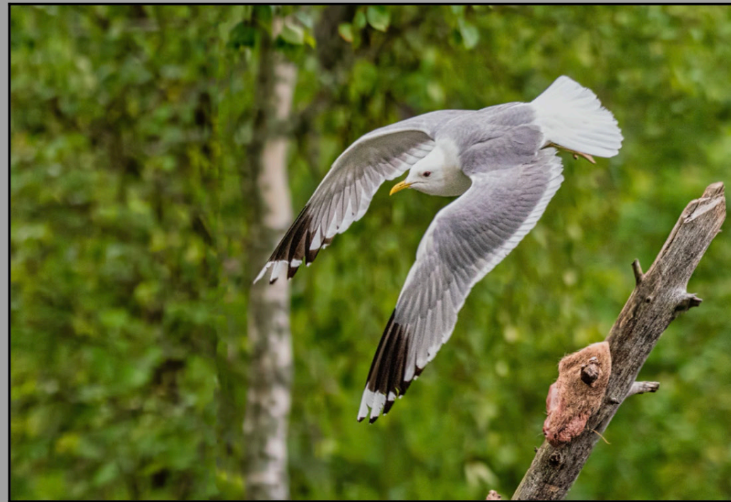
Mew Gull Checking Us Out