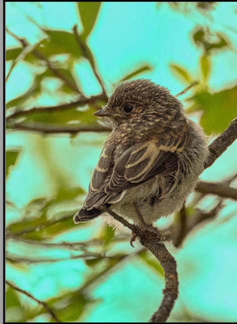
Pied Flycatcher, Juvenile