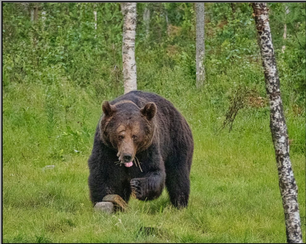
Big Man on Campus