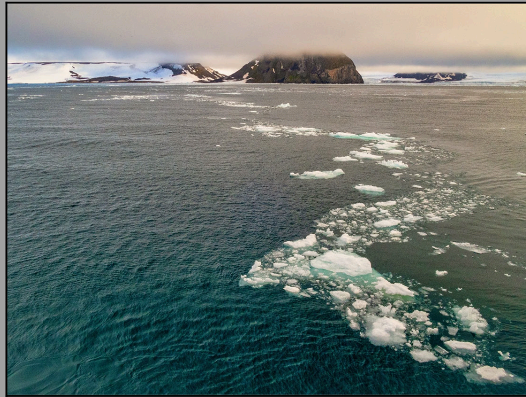
Follow the Ice