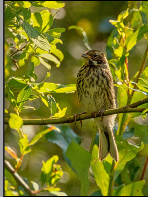
Rustic Bunting, Female