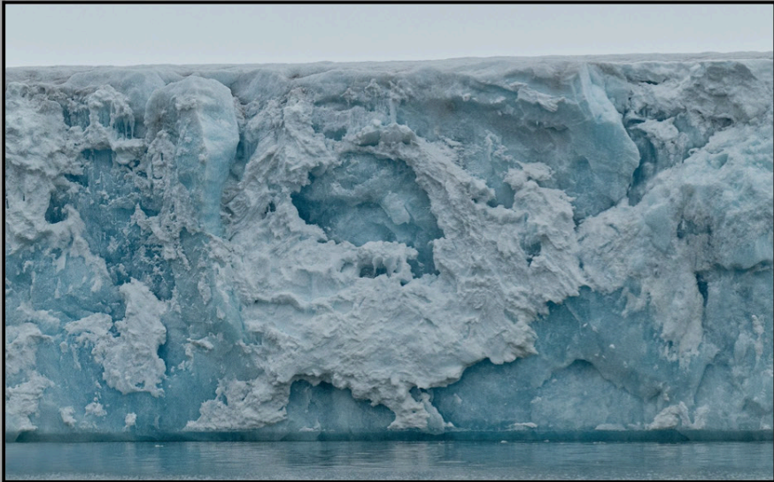
Artistry in Nature