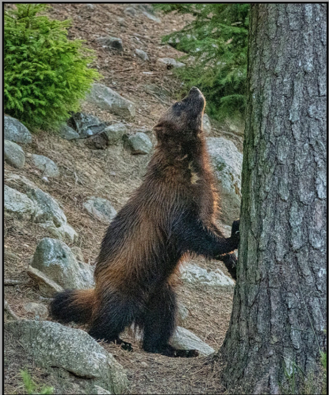
I See Food Up There!