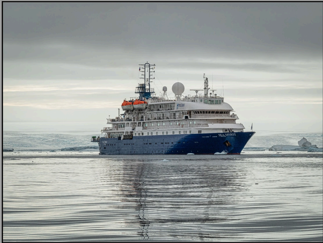
Our Home for the Franz Josef Land Expedition