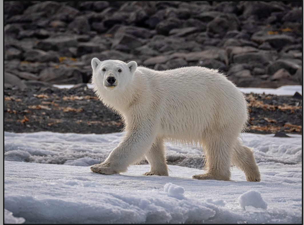
Guess What I Just Had for Breakfast?