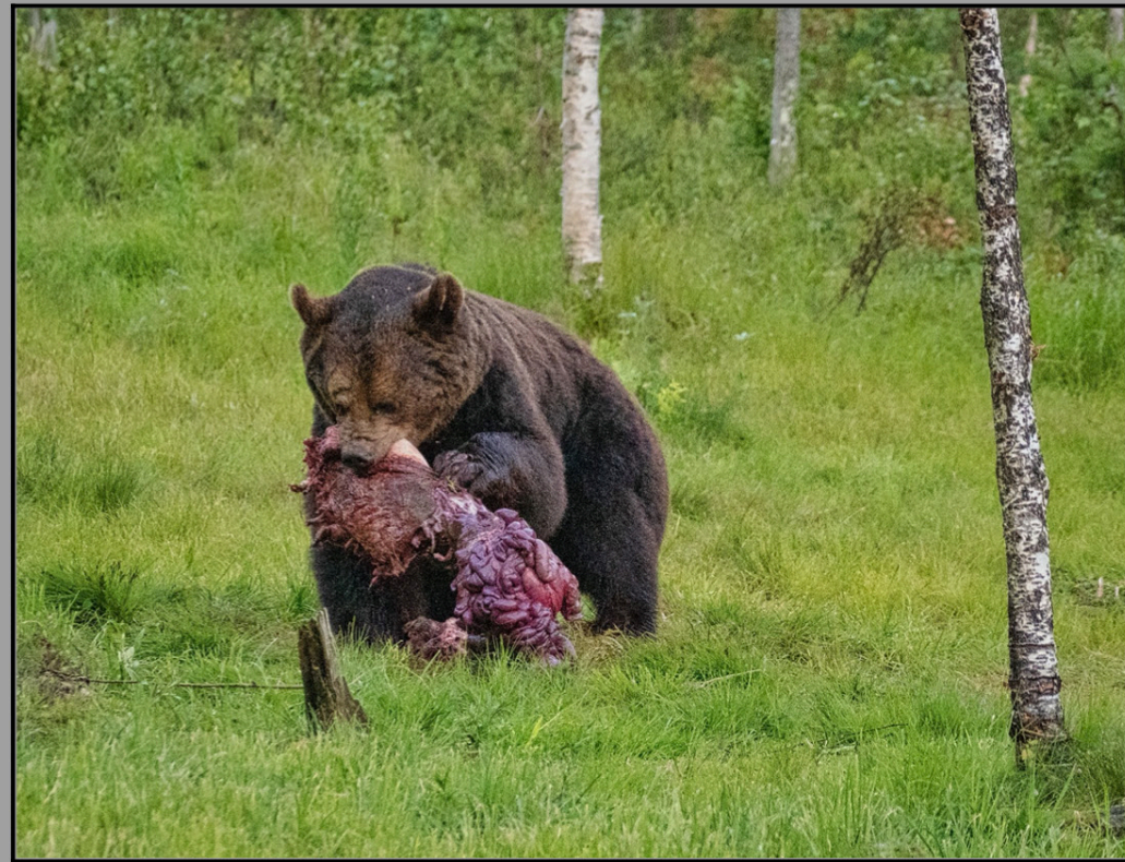
A Sumptuous Feast