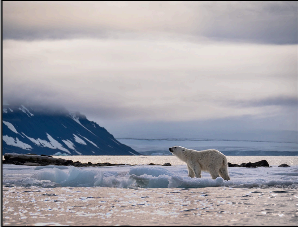
Finally Glorious View of Polar Bear on Apollonoff Island