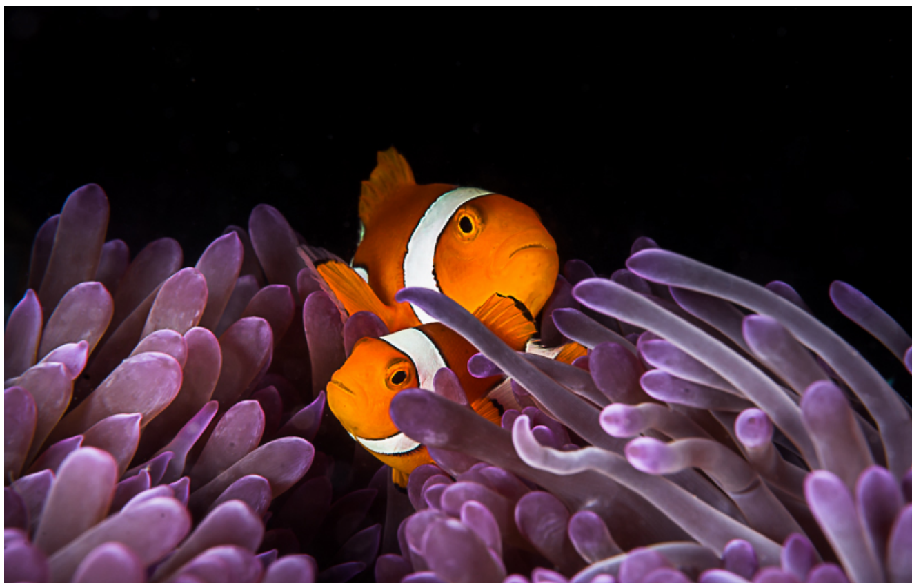
Clownfish © Greg Lecoeur