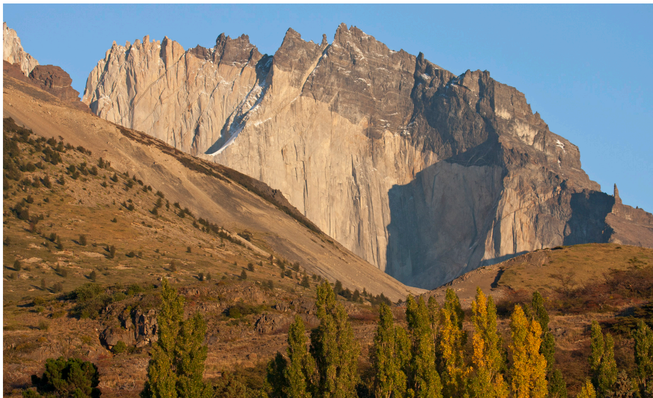
Torres del Paine National Park