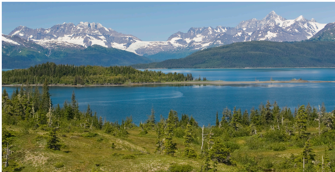
College Fjord