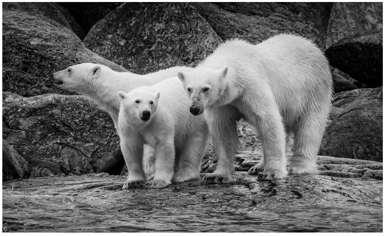
Polar Bear with Cubs

Svalbard Islands Realm of the Polar Bear June 24 to July 7, 2021