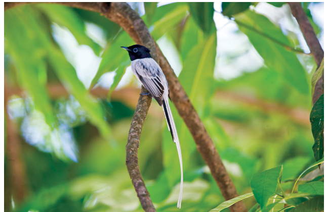
Malagasy paradise flycatcher

After an early morning search for Ifaty’s diverse birds, you will make your way down to Isalo National Park via Zombitse Forest. In this forest, you will have a chance to see Appert’s tetraka, a species listed Vulnerable by Birdlife International and which can only be found within two small regions of south-west Madagascar. Other highlights you may encounter include Madagascar ibis, Madagascar harrier-hawk, Madagascar cuckooshrike, Malagasy paradise flycatcher, and Malagasy spinetail. This region is also habitat for the shy fossa, which you may come across with a little luck and patience.