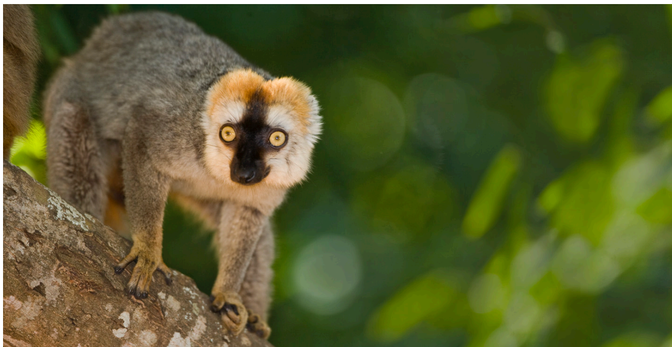
Red-fronted brown lemur