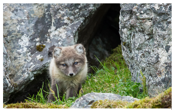
Artic fox cub

Alkhornet ~ At the mouth of Isfjorden, the largest of all Spitsbergen's fjords, you may land at Alkhornet where Arctic foxes search the cliff base for fallen chicks. Also at the base of the cliffs, Svalbard reindeer graze the luxuriant wildflower-covered vegetation, creating some of the best reindeer photography in the archipelago.