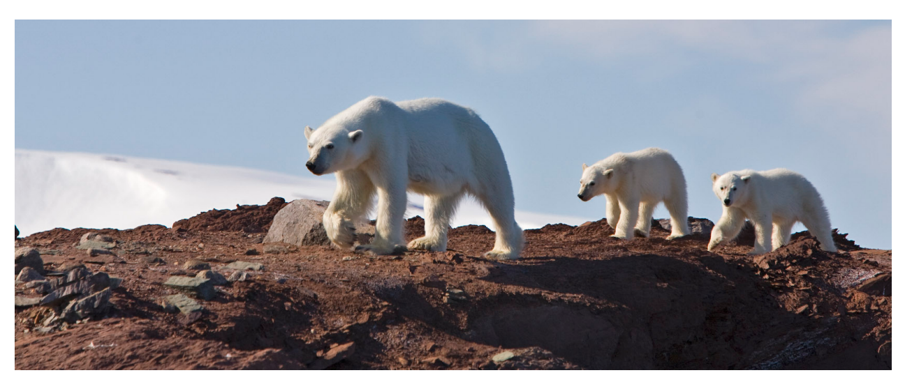
Polar bear and cubs