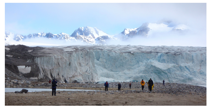
Glacier gazing

Ytre Norskøya ~ The small island of Ytre Norskøya, on the northwest coast of