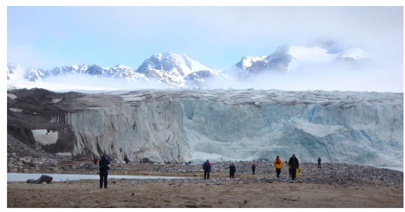
Glacier gazing

Liefdefjorden ~ You may sail to the mouth of Liefdefjorden and go ashore for a walk on the tundra of Andøya. Many geese feed on the tundra lushness at this time of year and you may also see the less common king eider. Monacobreen, with its five-kilometer-long face, is an impressive glacier at the end of this large fjord. Polar bears have been seen on the glacier, and the surrounding sea is a favorite feeding spot for thousands of kittiwakes.