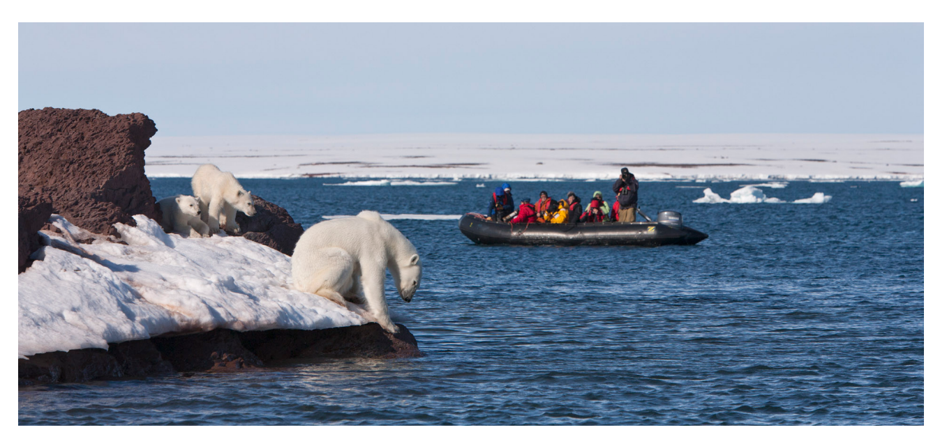
Polar bear viewing from the Zodiac