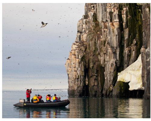
Birding at the cliffs

Alkhornet ~ At the mouth of Isfjorden, the largest of all Spitsbergen's fjords, you may land at Alkhornet where Arctic foxes search the cliff base for fallen chicks. Also at the base of the cliffs, Svalbard reindeer graze the luxuriant wildflower-covered vegetation, creating some of the best reindeer photography in the archipelago.