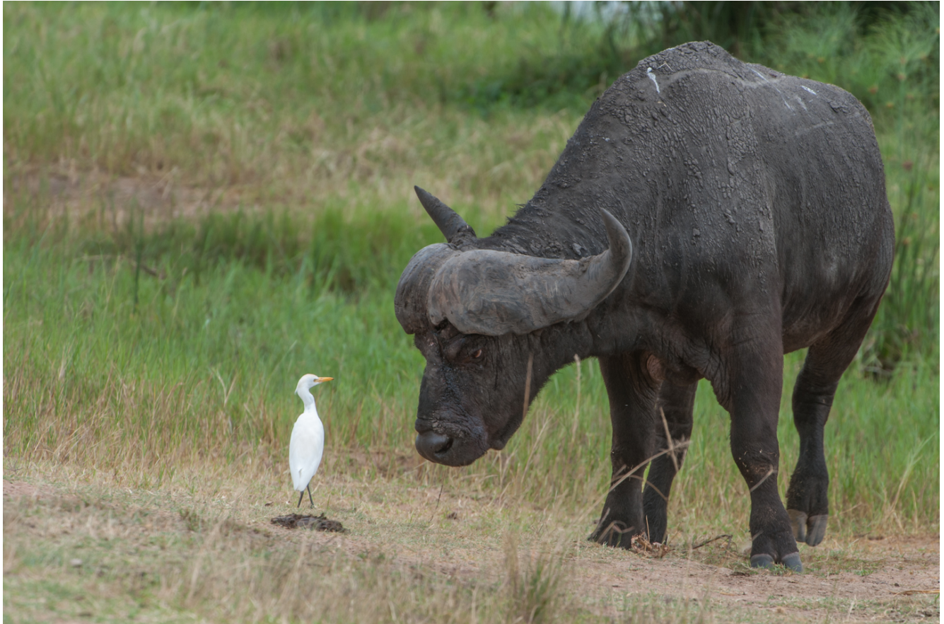
Buffalo and little egret