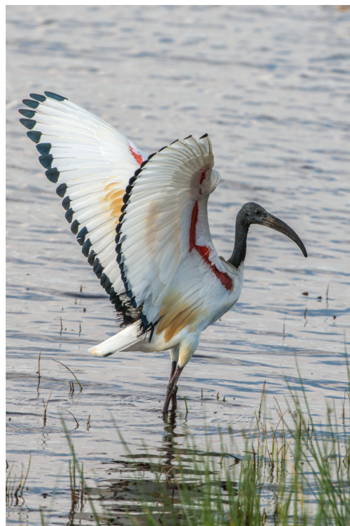
African sacred ibis

Khwai is a great ecotone area between the contrasting habitats of the marshy backwaters of the Khwai River, the dry-land leadwood, camel thorn woodlands, and savannahs – truly one of Botswana's birding meccas! Marula trees, a species of fig that produces the delicious liquor, and giant wild ebony trees shelter outstanding birdlife, such as bat hawks, in the delta that hunt along the entire length of the river. Away from the waterways, we will encounter hornbills, bee-eaters, rollers, starlings, and others.