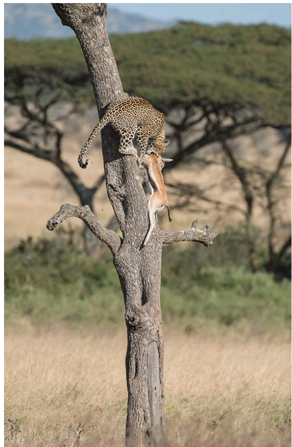
Leopard with lunch

Take an early morning boat trip on the Chobe River, within the heart of elephant country, where large herds congregate to drink and bathe. Later, you'll cross the Zambezi River into Livingstone to explore Victoria Falls, one of the Seven Natural Wonders of the World. The spectacular falls are the widest curtain of water in the world and plunge 330ft! Several species of birds, including trumpeter hornbills, do well in the moister forests bordering the falls.