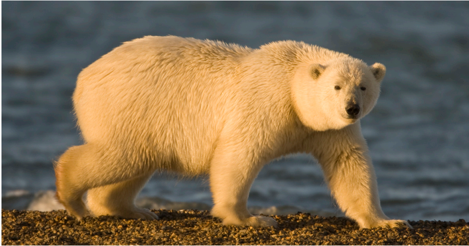
Polar bear