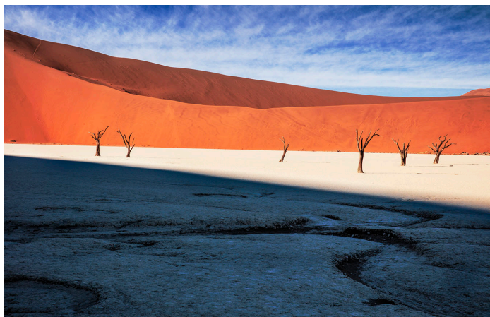
Salt Pans