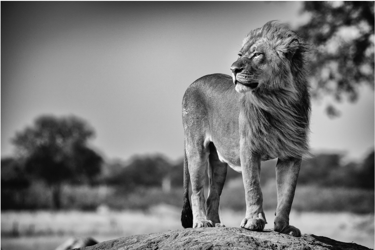
Lion