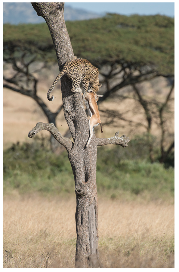
Leopard with lunch

You'll stop for wildlife along the way from Khwai to Savuti Marsh. You will see the remains of a once vast paleo-lake