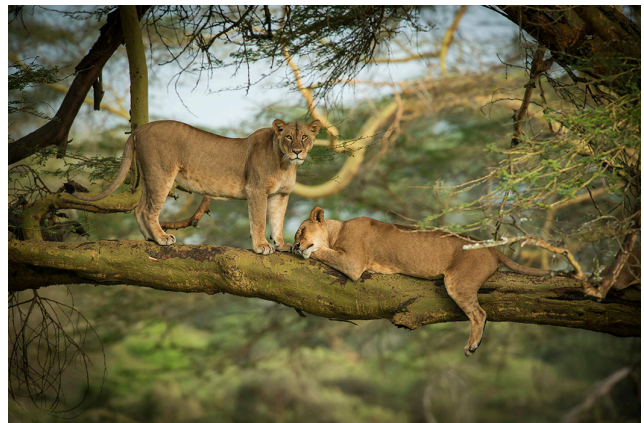
Tree Climbing Lions

Depart for an early morning game drive in search of elephants, hippos, buffaloes, and the famous tree climbing lions. Then, head to the mating ground of the