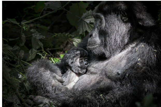
Mountain Gorilla Mother and Baby

Once you arrive at your family of gorillas, you have one hour with them as they go about their daily life. You will observe feeding, moving, playing, raising their young, and sometimes wrestling by the juveniles. Coming face to face with a giant mountain gorilla is a truly breath-taking wildlife experience!