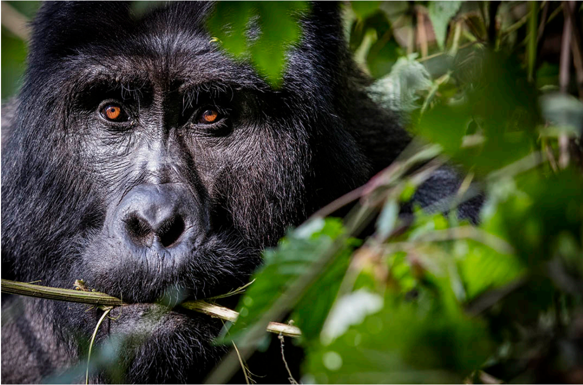
Mountain Gorilla