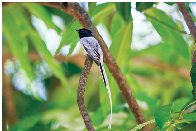
Malagasy paradise flycatcher

After an early morning search for Ifaty's diverse birds, you will make your way down to Isalo National Park via Zombitse Forest. In this forest, you will have a chance to see Appert's tetraka, a species listed Vulnerable by Birdlife International and which can only be found within two small regions of south-west Madagascar. Other highlights you may encounter include Madagascar ibis, Madagascar harrier-hawk, Madagascar cuckooshrike, Malagasy paradise flycatcher, and Madagascar spinetail. This region is also habitat for the shy fossa, which you may come across with a little luck and patience.