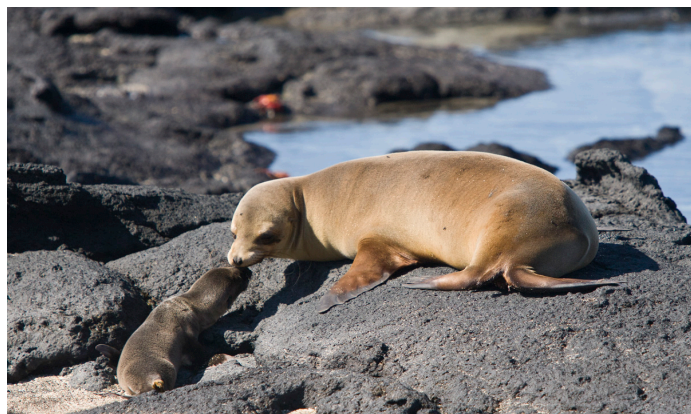
Galápagos fur seals

The small yet incredible island of South Plaza is your afternoon destination. This beautiful island is home to many land and marine iguanas. The colorful landscape is covered with reds and greens of Portulaca that may have yellow flowers that the iguanas enjoy eating. In the giant prickly pear cactus you can compare the cactus finch alongside small and medium ground finches. At the top of the island bachelor sea lions escape from the competition of stronger males as red-billed tropicbirds fly gracefully by.