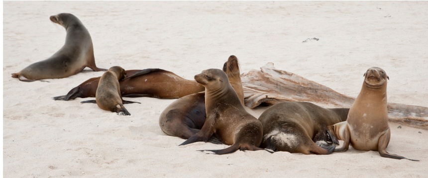
Galápagos sea lions

All routings and visitor sites on the Galápagos Islands are subject to change by the Galápagos National Park Service in an attempt to minimize traffic and impact.